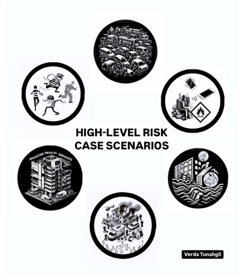
Figure 1. An illustration of risks indicating potential losses resulting from the improper positioning of health services headquarters following an earthquake.

Six high-level risk case scenarios illustrate how the wrong location of a health services HQ could lead to significant losses in a metropolitan area after a large-scale earthquake (Figure 1).