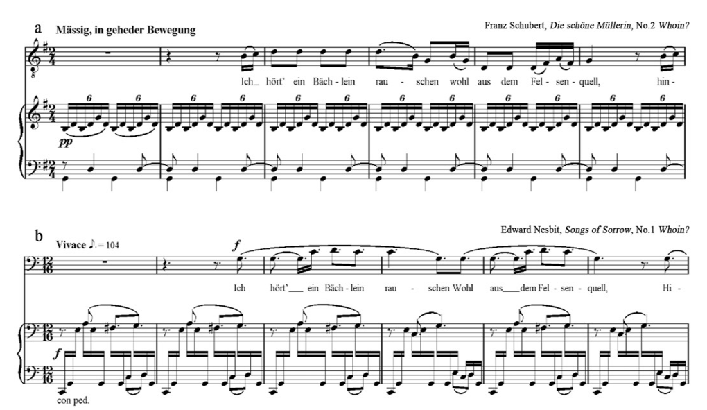
Figure 2. The texture symbolizing the brook in Franz Schubert and Edward Nesbit's Wohin?

detailed analysis, it's important to clarify the criteria for similarity and difference in this study. Undoubtedly, similarity in composition should not be interpreted as mere copying or replication, and differences should not solely aim for individuality without purpose, as such works would either waste resources or confuse the audience. With the premise of narrative text, a connection is established between the music and the text, and different composers reinterpret the text through their own musical language based on their understanding. In this process of re-narration, there will be some degree of similarity or individual temperament in the depiction of scenes and emotional expressions in the text, resulting in both similarities and distinctions in the compositions. By examining the musical appearances, we can identify similarities or differences between the two, which will better reflect the composers' understanding of the text, rather than simply being completely identical or opposite in meaning.