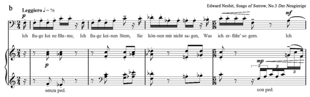
Figure 3. The texture symbolizing the miller in Franz Schubert and Edward Nesbit's Der Neugierige

Der Neugierige clearly demonstrates the contrasting attitudes of the two composers (See Figure 3a and 3b). In this passage, Schubert is evidently inspired by the first two lines of the poem, "Ich frage keine Blume" (I ask no flower) and "Ich frage keinen Stern"