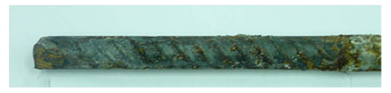
Fig. 1. Steel bar extracted from the concrete specimen contaminated with 2% chloride [17].

Al-Amoudi and friends indicated that calcium nitrite was explicitly effective in retarding corrosion and reducing corrosion rates in chloride and chloride plus sulphate contaminated concrete based on his tests of various corrosion inhibitors in concrete that was contaminated with brackish water, sulphates, chlorides, unwashed aggregates and seawater. Figures 1 and 2 below illustrate the distinct difference in case of calcium nitrite usage for preventing the corrosion of reinforcing steel in concrete.