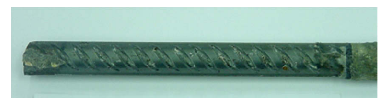
Fig. 2. Steel bar extracted from the concrete specimen contaminated with 2% chloride and incorporating CI-1 inhibitor [17].

However there are two important factors which are affecting the efficiency of calcium nitrite. First one is the concentration ratio of chloride to nitrite ions. Calcium nitrite increases the threshold of chloride concentration to start corrosion by contending with the chloride ions reacting with the steel, thus the concentration ratio of chloride to nitrite ions becomes an important matter to prevent corrosion. Different studies reported different chloride to nitrite ratios for corrosion prevention which fluctuates between 1.1/1.4 to 1.5/3.0 [10, 13].