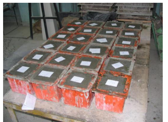
Figure 2. A view of concrete poured into many molds

The concrete produced using the materials detailed above was poured into molds under laboratory conditions and this is shown in Figure 2.