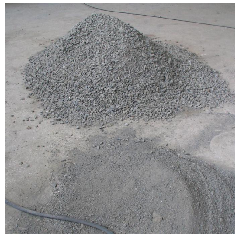
Figure 1. Limestone aggregate used in experiments

The limestone rock described earlier was taken from the crusher to the KTÜ Civil Engineering Department Building Materials Laboratory. In this case the sieve system follows the guidelines in TS 1226 ISO 3310-2 and TS 1227 ISO 3310-1 (TSE 1996) as stated in TS EN 12620 (TSE 2003). The biggest grain size that can pass through the sieve is 16 mm and only grains that are 16 mm in size or smaller will be sifted. There are three sizes of particles: large (more than 8 mm) medium (between 8 mm and 4 mm) and fine (less than 4 mm). The table 1 shows values for the weight of individual particles how much water they can hold and how heavy they are when wet or dry. These values were measured using specific methods outlined in TS EN 1097-6 (TSE 2002) and TS 3529 (TSE 1980).