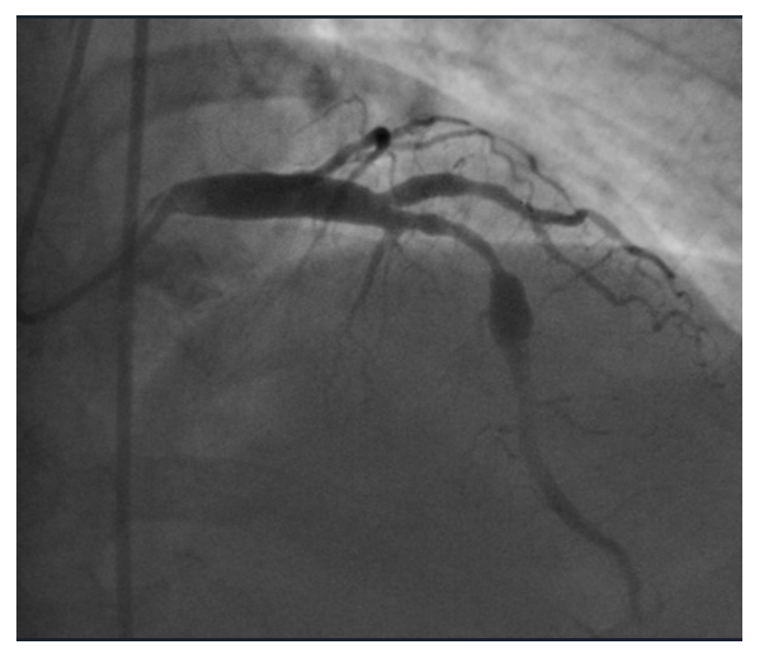
Figure 3. Left anterior descending arter aneurysms

In addition, the prevalence of atherosclerosis and MI in the control group was consistent with general population rates, supporting previous data. This provides a relevant baseline for comparing cardiovascular risks in patients with CAAs.<sup>29</sup> CAAs are characterized by abnormal vessel dilation, posing risks due to potential hemodynamic stress, which may lead to further dilation or rupture. CAA aneurysms have a prevalence of 0.3%-5% in coronary angiography patients.<sup>30,31</sup> Our study's frequent LAD artery aneurysms align with previous findings emphasizing the LAD's functional dominance in coronary circulation ( Figure 3 ). While CAAs are not directly caused by atherosclerosis, they can promote it, especially in individuals with cardiovascular risk factors.<sup>28,32</sup> Our findings suggest CAA aneurysms increase the risk of atherosclerosis and MI, likely due to hemodynamic stress, structural weakness, and