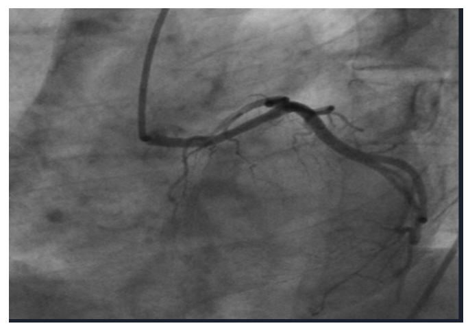
Figure 1. Left main coronary artery originating from the right coronary sinüs (type IV)

coronary artery in cases with interarterial outlet anomalies. This deviation may lead to structural changes that could disrupt blood flow or obstruct coronary perfusion, predisposing individuals to myocardial ischemia and sudden cardiac death. Rooted in embryological errors, these anomalies, including abnormal aorta-pulmonary pathways, disrupt normal blood flow and increase the risk of CAD. In our study, two cases were observed in which the coronary arteries passed behind the aorta without the risk of interarterial compression, both of which did not exhibit myocardial ischemia (Figure 1).<sup>20-22</sup>