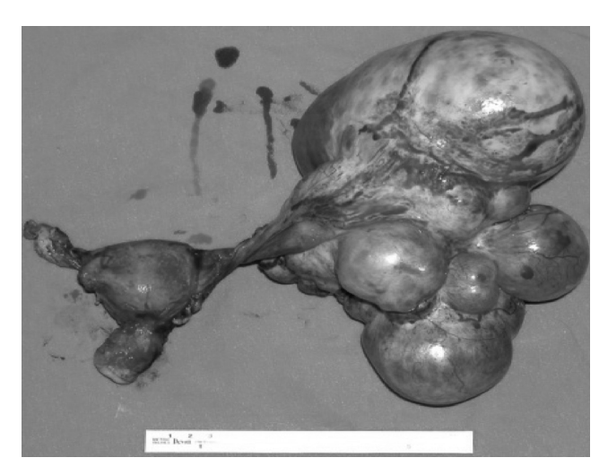
Figure 2-Total abdominal hysterectomy and bilateral salphingooferectomy specimen just after resection

Another presentation type of struma ovarii is benign characterized pelvic mass with ascites and accompanying pleural effusion so called as pseudo-Meig's Syndrome with elevated ca125 levels and only 8 cases have been reported so far (12). 9 other cases have been reported to be with ascites, elevated ca125 levels and struma ovarii alltogether without pleural effusion until 2009(13). This is the tenth case through