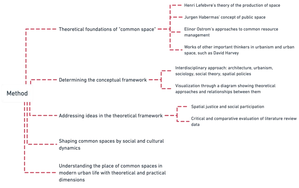
Figure 1. Mind Map of Article Method