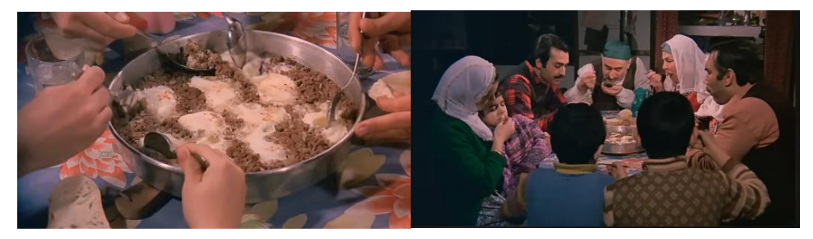
Chart 1. Scene 21' Semiotic Analysis