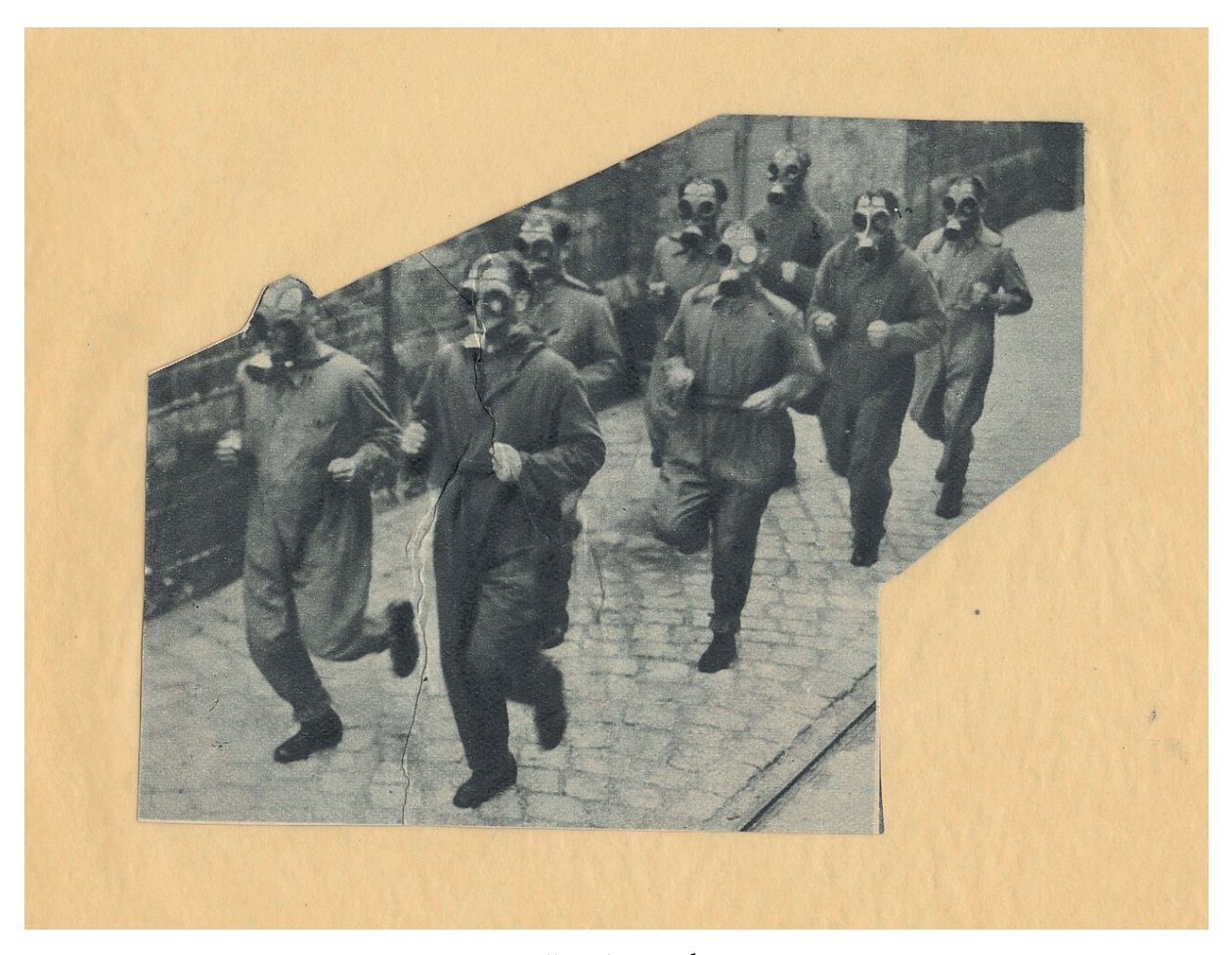
Collage by Brecht.

Walter Benjamin talked about dialectics at a standstill, so here we get that sense of the dialectical image freezing linear time, disrupting the flow of time to study and to inspect what's going on. As he says, thinking involves not only the flow of thoughts, but their arrest as well, in a configuration pregnant with tensions. So again, that sense of stopping the flow of time so you can analyse the tensions and conflicts within it. Dialectical images have a spatialising dimension in order to disrupt time. And here, in this collage by Brecht you've got three different times colliding, you've got a sort of fitness and leisure time, you've got work time and you've got wartime, all coming together in the same image.