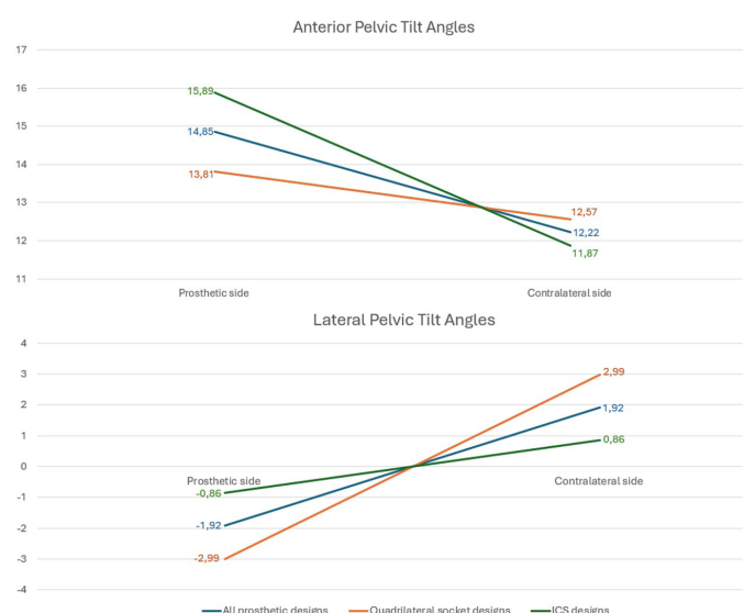
Figure 2. Anterior and lateral pelvic tilt angles on the prosthetic side and