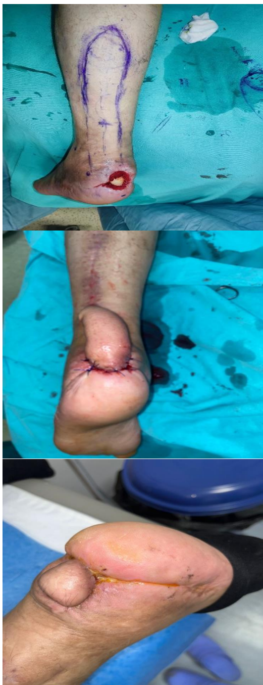
Figure 3. Preoperative (left), postoperative (middle) and control (right) view of the wound site on the heel of the left foot after surgery.