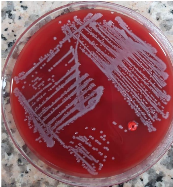
Figure 2. Opaque, non-hemolyzing, colorless and round shaped colonies were observed on blood agar.

A. faecalis is a rarely isolated pathogen in our hospital and is an oxidase positive bacterium. Due to the incompatibility of conventional methods, the strain was also identified by MALDI-TOF MS. All isolates were identified as Acinetobacter baumannii by MALDI-TOF MS and remarkably as A. faecalis by VITEK 2.