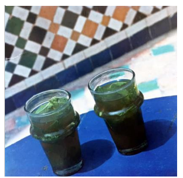
Typical Turkish Coffee Cup on a postcard used in the Young Hopes Ankara Digital Storytelling Workshop (on the left), typical Moroccan mint tea glasses on a postcard used in the Young Hopes Rabat Digital Storytelling Workshop.

At the end of the Young Hopes Ankara and Rabat Digital Storytelling Workshops, we asked our participants to write or draw something about their future plans. Now we have those postcards in our workshop for display as another way of enhancing story circles. Our hope is that some other people will become connected to these stories.