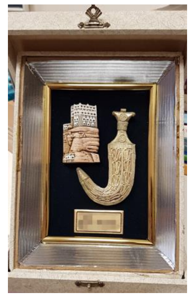
A reminder from our refugee from Yemen

In addition to the certificate, one of our participants who is from Yemen took out the little ornament he had brought to Morocco with him and wanted one of the participants to translate from Arabic to English that he wants to give that ornament to us to bring to our unit. Although we didn't want to take that very special remembrance from him, he insisted and we brought it to our workshop as a memory of our participant as a part of our homework.