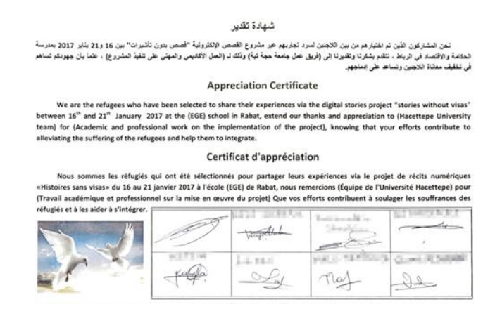
The Appreciation Certificate the Digital Storytelling Unit team received after the January 2017 DST workshop in Rabat.

In addition to the certificate, one of our participants who is from Yemen took out the little ornament he had brought to Morocco with him and wanted one of the participants to translate from Arabic to English that he wants to give that ornament to us to bring to our unit. Although we didn't want to take that very special remembrance from him, he insisted and we brought it to our workshop as a memory of our participant as a part of our homework.