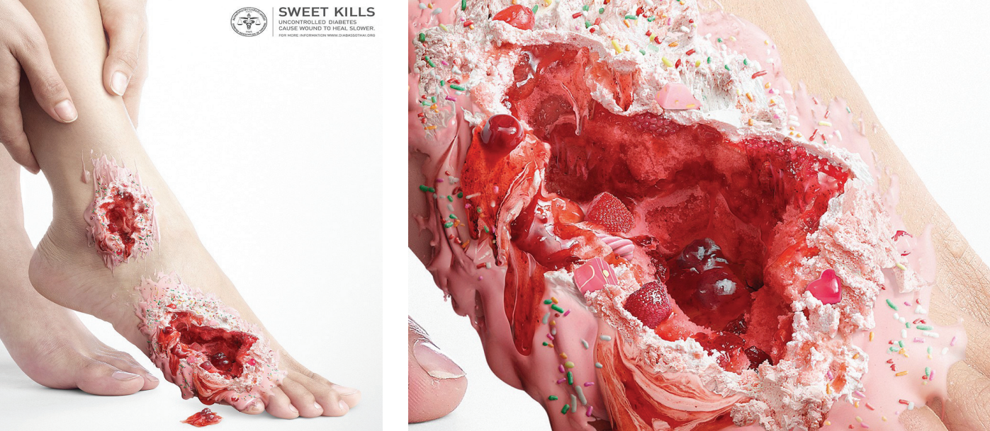
Figure 3. Poster with social context ( http://sala7design.com.br/2016/02/sweet-kills-pecas-que-apresentam-riscos-da-diabetes.html )

43444649175589/594595287393856/?type=3&theater). At this point, the prospect of photographic art is increasing day by day with the possibilities of developing computers and computer programs. Parallel to these, in our days as visually gained so much importance; photography in poster design is a simple, effective and powerful way of conveying clear and direct message to the recipient.