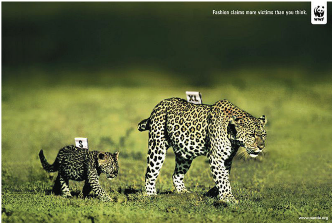
Figure 7. "Fashion claims more victims than you think", WWF ( http://www.flickr.com/photos/houtlust/2867898321/sizes/o/ )

continue to operate on a voluntary, nonprofit-oriented basis and thus aim to have a significant impact on society in a more livable environment. In this context "Fashion claims more victims than you think" is a highly creative and remarkable ad made for the WWF organization by Agency Ogilvy & Mather advertising agency. This ad is awarded with "The Concerned Communicator Award". The ad shows a mother leopard followed by her young cub, and they both wear size tags on their back, XL for the mother and S for the cub. Despite the small use of the text in this ad, the desired message "Fashion claims more victims than you think" is presented in a very strong, clear and impressive manner, to the recipient using the credibility of the photograph (Figure 7.) (Lust. http://drprem.com/marketing/wwf-fashion-claims-more-victims-than-you-think.html ).