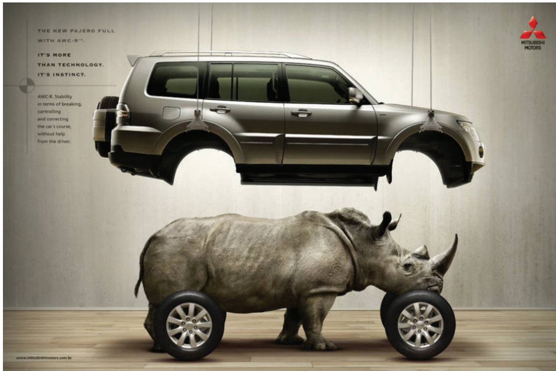
Figure 5. Advertising poster http://pzrservices.typepad.com/.a/6a00d83451ccbc69e201156f579797970b-pi

Posters can be sometimes designed to be a photo without a writing, sometimes a word or writing with a photograph. Whatever the design is, the meaning in the poster should be resolved in a few seconds by viewer-receiver. So "posters differ from television or radio or magazines. Because most of the time, it is us passing in front of the image when we are walking, traveling, turning a page. The situation on the television screen is somewhat different; it is our choice to see the visual on the screen, we cannot look at the advertisement, we can reduce the sound, or we go to prepare coffee in the kitchen. Despite all this, ad images, passing in front of us like fast-moving trains to a distant station, may impact on us whether we are aware or not." (Berger, 2010: 130).