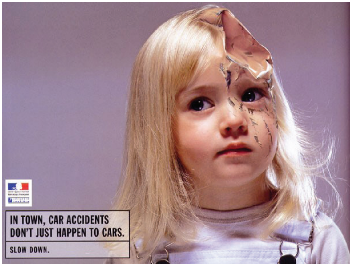
Figure 1. Poster with social context ( http://desigg.com/daily-design-inspiration-4-120-creative-advertisements )

There is 940 years between the first paper and invention of typewriter. Printing traveled from China to Europe in 231 years and 174 years more was needed for the first printer to take place. But when we look at the last century, there is only 19 years between the first print press magazine and the communication arts magazine. Very next year after the first apple computer, which works on byte maps, front-page software came to stage and tabletop publishing term is defined. After only four years Photoshop is released. When we reach 20th century, graphic design changes at a dizzying pace in parallel with technological developments.