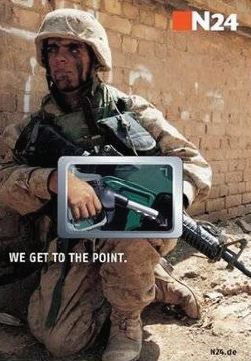
Figure 6. Poster with social context

multiplied and shared at high speed by the help of the developing technology and internet getting into our lives. Sharing information at high speeds and information abundance has their disadvantages as well as their advantages. In this complexity of information, it is necessary to design and organize existing knowledge so that we can extract the necessary information and benefit from it freely. In this case, there is need for an information design, which aims to solve the existing information within the framework of communication and aesthetic principles, transforming it into a simple and visual form that can be perceived by large target groups easily" (Özmen, 2012: 9).