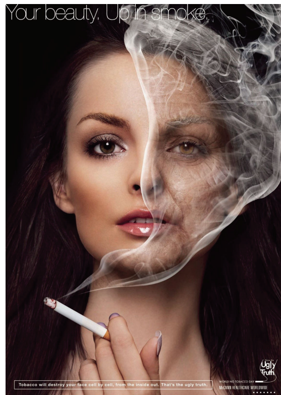
Figure 4. Poster with social context ( http://www.luerzersarchive.com/en/magazine/print-detail/mccann-healthcare-worldwide-japan-inc-46499.html )

Photography is used instead of writing in an advertisement to make the impact, which is aimed by the designer on viewer-receiver (Figure 4.).