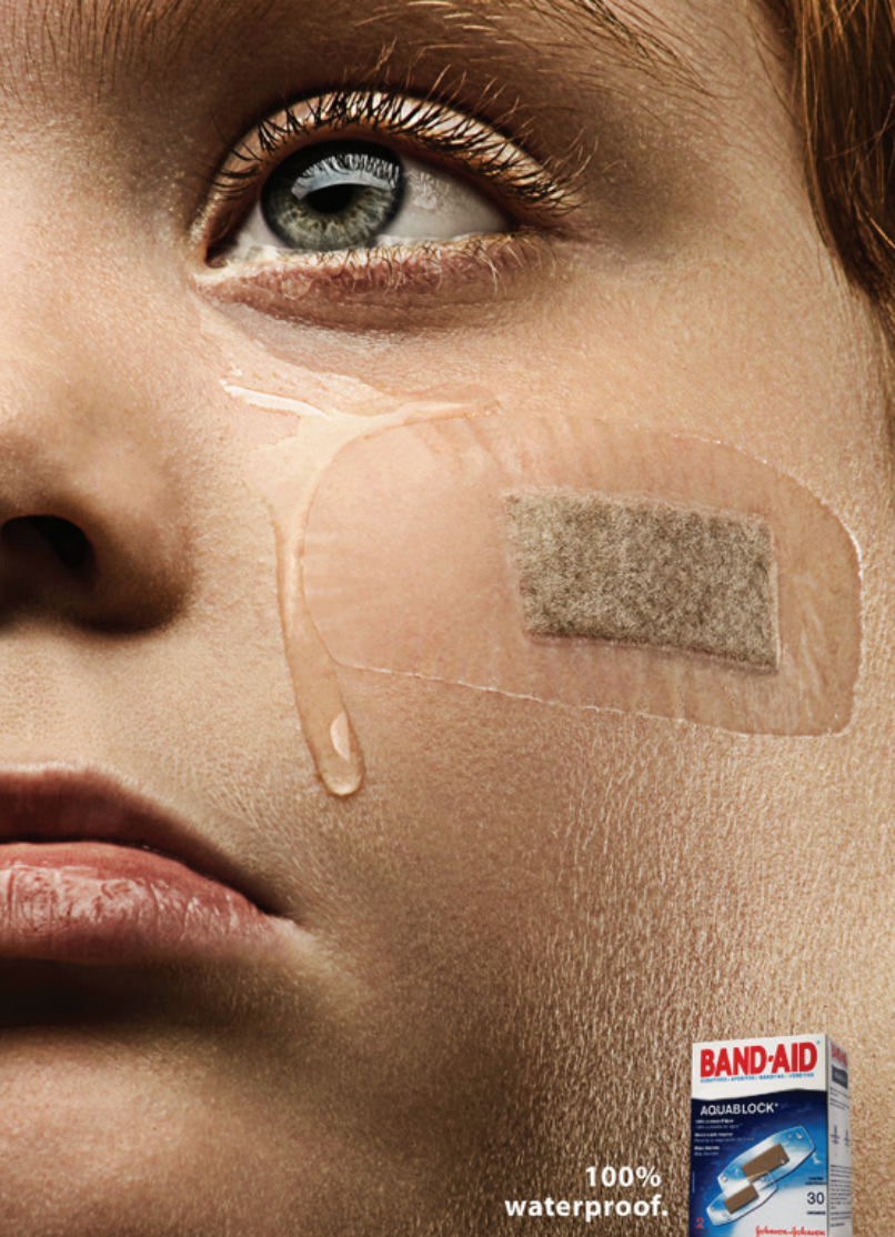
Figure 11. Advertising poster ( http://www.fromupnorth.com )

We have a very competitive advertisement media so to affect the consumers advertisers search extraordinary compositions. And this makes the creativity very important at advertisement photography.