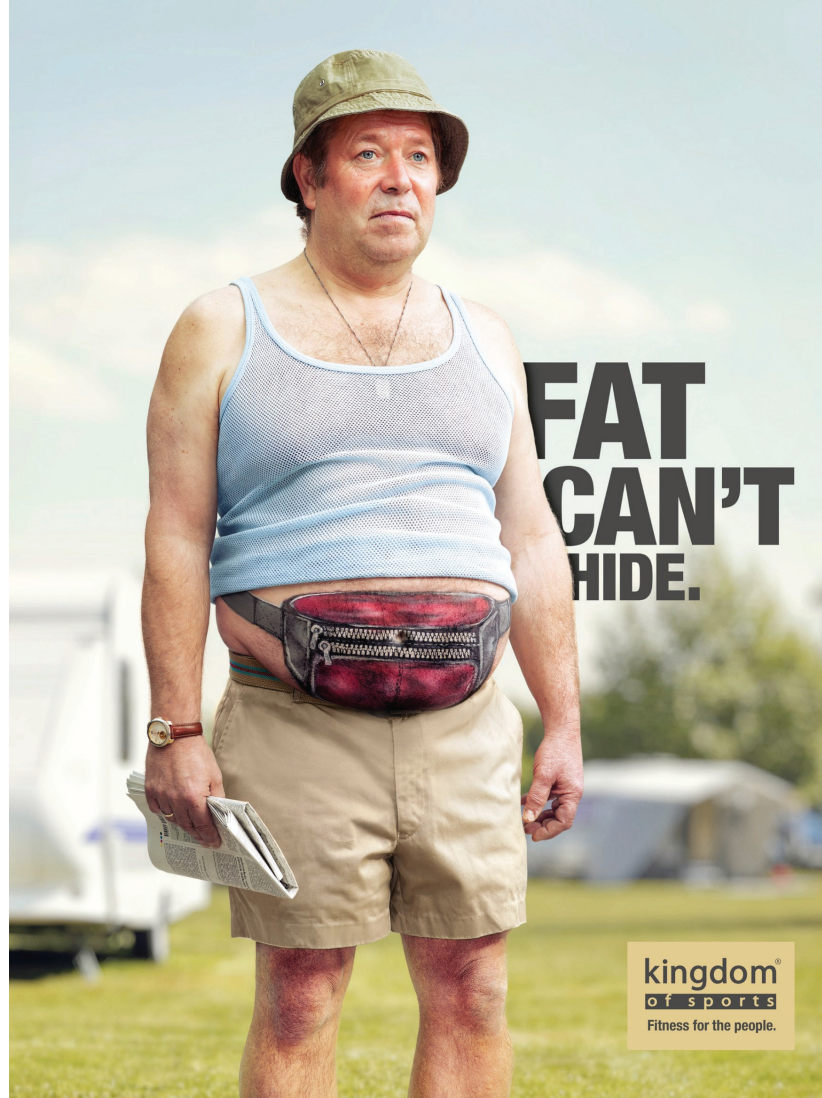
Figure 2. Advertising poster ( http://www.creativeadawards.com/fat-cant-hide-2/ )

For example, posters with social content are designed to inform the community about topics like environment, health, education, family planning, avoiding traffic accidents, cigarettes and alcohol and Aids etc. Posters brochures and open-air advertisements can attain all classes of