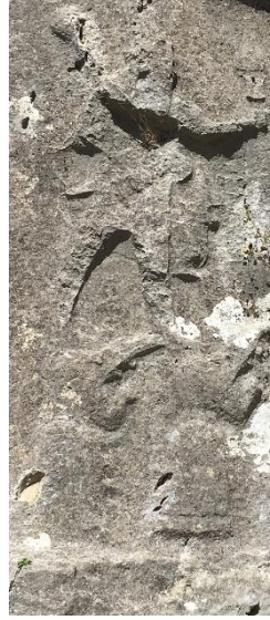
Fig. 14. The depiction of Teššub on Yazılıkaya Reliefs ( https://www.hittitemonuments.com/yazilikaya ).

On the Arslantepe orthostat, dated to the Late Hittite Period and inscribed with MALATYA 8 inscription, the god is depicted with bulls. This shows that the relationship between the god and bulls continued during this period. The absence of the god being depicted on a mountain pair, as seen in the Hittite Period, can be explained not by a cultural difference, but rather by the lack of space on the orthostat to include the mountain pair or by geographical reasons.