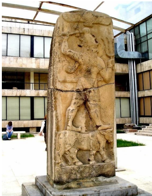
Fig. 3. The depiction of Tarhunza of the Army ( https://www.hittitemonuments.com/tellahmar ).

In the inscriptions of the Late Hittite Period, we also see a form of Tarhunza associated with the fertility and protection of royal vineyards. In SULTANHAN (CHLI I, SULTANHAN §1-9, 12, 22-29, 34-36, 47-51), BOR (CHLI I, BOR §2-7, 8-11), İVRİZ 1 (CHLI I, §1-2) and İVRİZ 2 (Dinçol, 1994; Röllig, 2013) inscriptions, the god is referred to as the "Tarhunza of the Vineyard". The iconographic features of this form of Tarhunza can be learned from the depiction on the İvriz Rock Monument in Ereğli, Konya. In the relief on the İvriz Rock Monument, the