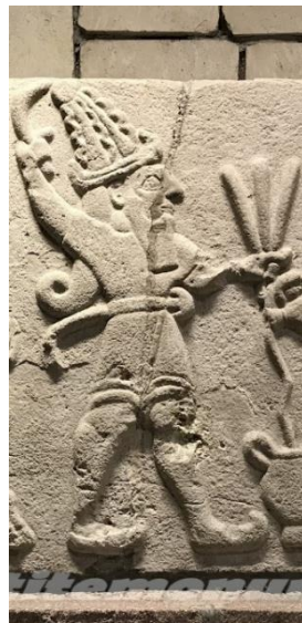
Fig. 9. The depiction of Teššub on the middle section of the orthostat with MALATYA 8 inscription ( https://www.hittitemonuments.com/arslantepe/arslantepe ).

In addition, the god is also associated with bull in this period. On the left section of the orthostat inscribed with MALATYA 8 inscription, the god is depicted atop a chariot drawn by two bulls. In this representation, the god holds a curved sword in his raised right hand, the reins of the chariot in his left hand, and a sword is also present at his waist (Fig. 10).