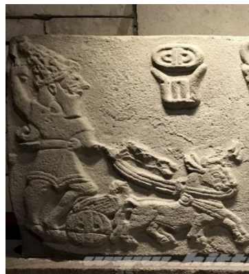
Fig. 10. The depiction of Teššub on the left section of the orthostat with MALATYA 8 inscription.

In addition, the god is also associated with bull in this period. On the left section of the orthostat inscribed with MALATYA 8 inscription, the god is depicted atop a chariot drawn by two bulls. In this representation, the god holds a curved sword in his raised right hand, the reins of the chariot in his left hand, and a sword is also present at his waist (Fig. 10).