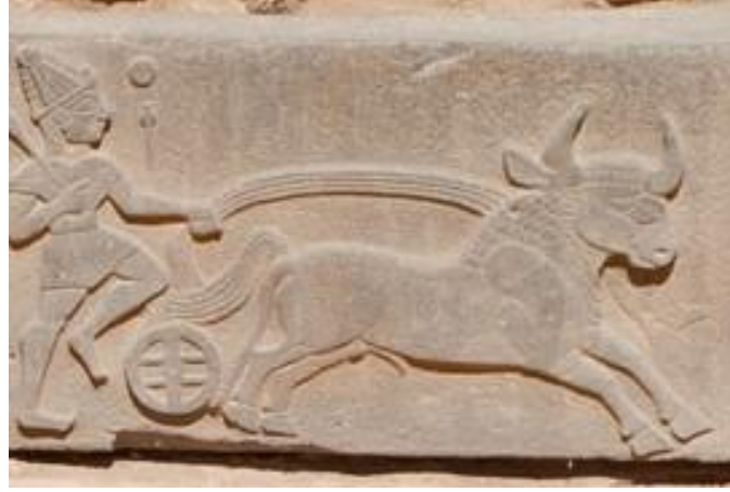
Fig. 8. The depiction of Storm God of Aleppo on the orthostat with ALEPPO 4 incipion.

During this period, the god is recognized as being associated with bull. One of the orthostats found in the god's temple in Aleppo, dating to this period, depicts the god as a figure holding a mace in his right hand, bent toward his shoulder, and the reins of a chariot drawn by two bulls in his left hand (Fig. 9). In ALEPPO 4 incipion on this orthostat, the god's name is read as "Divine Mace" (CHLI III, ALEPPO 4 §(a)).