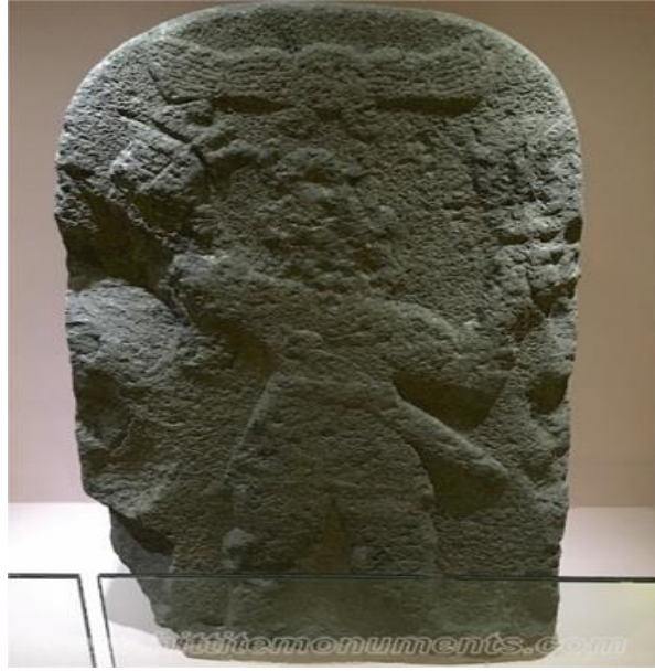
Fig. 1. The depiction of Tarhunza on the stele with ŞEKERLİ inscription ( https://www.hittitemonuments.com/sekerli/ ).

A different example of the above composition can be seen in Karkamış. KARKAMIS A1a inscription, carved on the structure known as the Long Wall, mentions “Samarkaeian Tarhunza”, associated with the concept of conquest (CHLI I, KARKAMIŞ A1a §3, 7-15, 24-27, 36-38; Peker, 2022b). † A depiction of this god is also found on the Long Wall. Here, the god is portrayed holding a sword at his waist, a single-headed axe raised in his right hand, and a short trident in his left hand extended forward (Fig. 2).