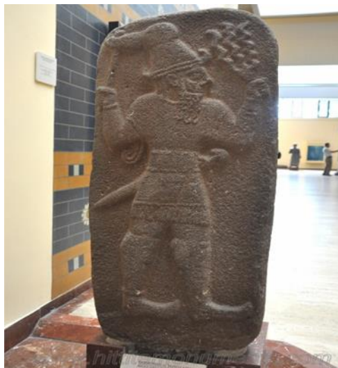
Fig. 8. The depiction of Storm God of Aleppo on the stele with BABYLON 1 inscription.