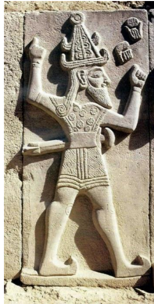
Fig. 12. The depiction of storm god of ALEPPO on the orthostat with ALEPPO 5 incscription.

On İmamkulu Rock Relief from the Hittite Period, Storm God of Aleppo, whose name is written in İMAMKULU inscription on the relief, is depicted driving a chariot drawn by two bulls. The god holds a mace in his right hand, which is bent towards his shoulder, while holding the reins of the chariot with his left hand. He wears a sword at his waist (Fig. 13).