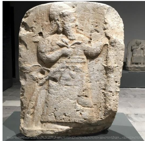
Fig. 5. The depiction of Tarhunza on stele with ADANA 1 inscription ( https://www.hittitemonuments.com/karkamis/kargamis120.htm )

Another form of Tarhunza, similar to the Tarhunza of the Vineyard, is Tarhunza referred to by epithet "Masahunali" in ADANA 1 inscription (CHLI III, ADANA 1). In relief carved on stele with this inscription, the god is depicted holding a grapevine in his right hand pressed against his chest and a bundle of long-stemmed wheat ears extended forward in his left hand (Fig. 5). 1