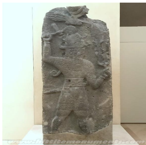
Fig. 6. The depiction of Storm God of Heaven on the stele with TELL AHMAR 2 inscription ( https://www.hittitemonuments.com/tellahmar ).