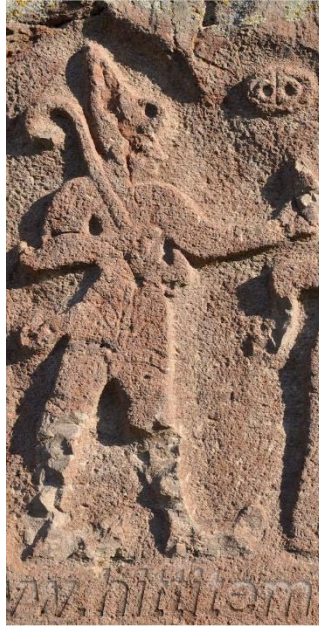
Fig. 16. The depiction of Teššub on the orthostat in Ortaköy.