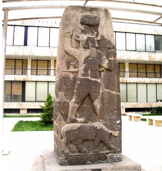
Fig. 7. The depiction of Storm God of Heaven on the stele with CEKKE incription ( https://www.hittitemonuments.com/cekke ).