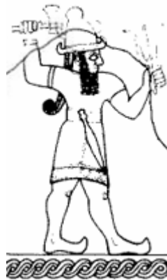
Fig. 2. The depiction of Samarkaeian Tarhunza (Bunnens, 2021, fig. 69).

A different example of the above composition can be seen in Karkamış. KARKAMIS A1a inscription, carved on the structure known as the Long Wall, mentions “Samarkaeian Tarhunza”, associated with the concept of conquest (CHLI I, KARKAMIŞ A1a §3, 7-15, 24-27, 36-38; Peker, 2022b). † A depiction of this god is also found on the Long Wall. Here, the god is portrayed holding a sword at his waist, a single-headed axe raised in his right hand, and a short trident in his left hand extended forward (Fig. 2).