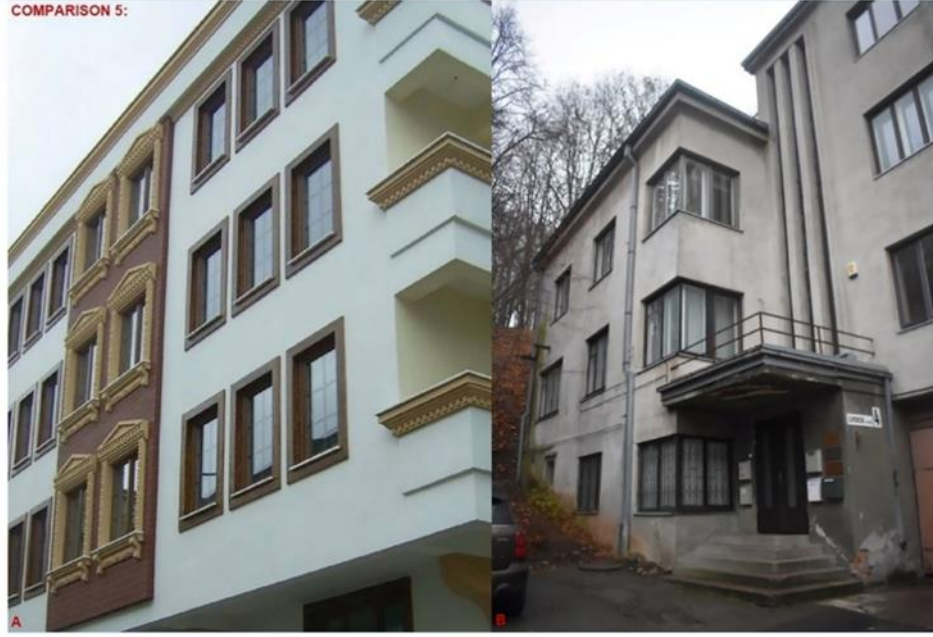
Fig 6: Example of the comparison sheet in the questionnaire which has been used for the analysis. 1) Turkey 2) Lithuania