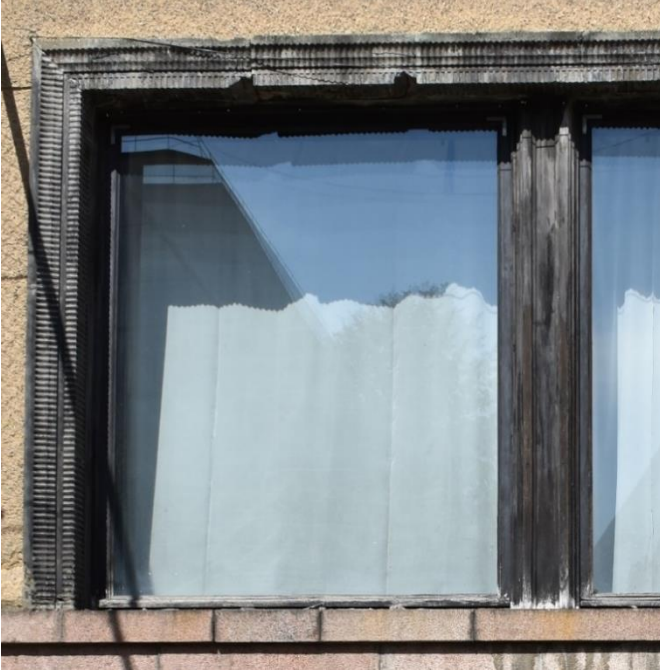
Fig 2: Detail of Central Post Office 1930-1932