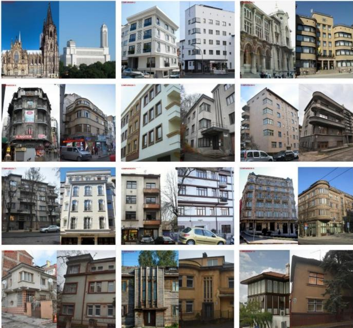
Fig 5: The comparisons which have been demonstrated

An example of the usage of merged images in more detail is demonstrated in Figure 6.