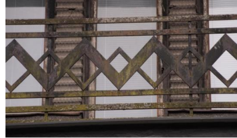
Fig 4: Pažanga Company 1933 (Ref 4: Huriye Armağan DOĞAN, 2017)

It can be stated that the expression in Kaunas originates from the fact that a remarkable number of buildings constructed in the interwar period have the impact of individuality and authenticity. When buildings with the expression of Modernism were erected in Berlin, most of them were in the form of social housing. Therefore, the sensitivity of the users was disregarded. As a result, the architectural style which had its emphasis on the users and functionality for the users failed to fulfil the real needs. Furthermore, it established a language which was an average interpretation that can accommodate various people. This was one of the essentialities at the time, related to the need for an immense number of dwellings because of the World War, and furthermore, to the problems caused by the extensive immigration to the city from the countryside. As a result, the architecture was economically feasible, however, it did not pay attention to the peculiarities of the location.