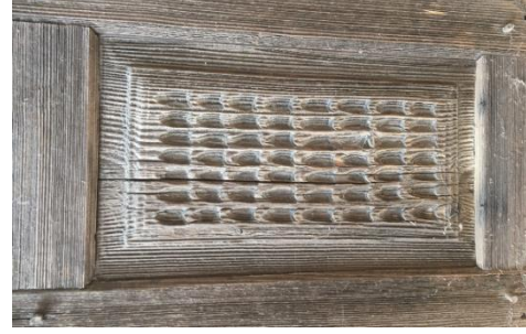
Fig 3: Shutter from N.Lithuania (Ref 3: Huriye Armağan DOĞAN, 2017)