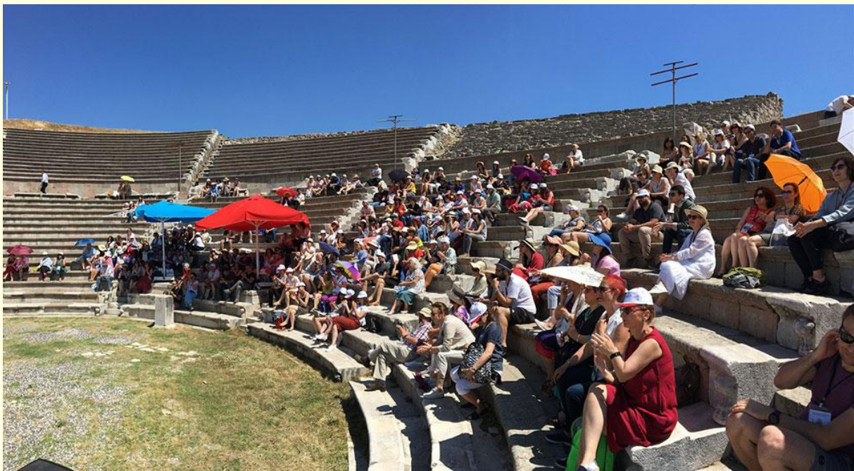
Figure 4. Images from the Group Psychotherapy Congresses (in Bergama Asclepion) ( https://bergama.meb.gov.tr/www/uluslararasi-katilimli-46-grup-psikoterapileri-kongresi/icerik/1004 ).