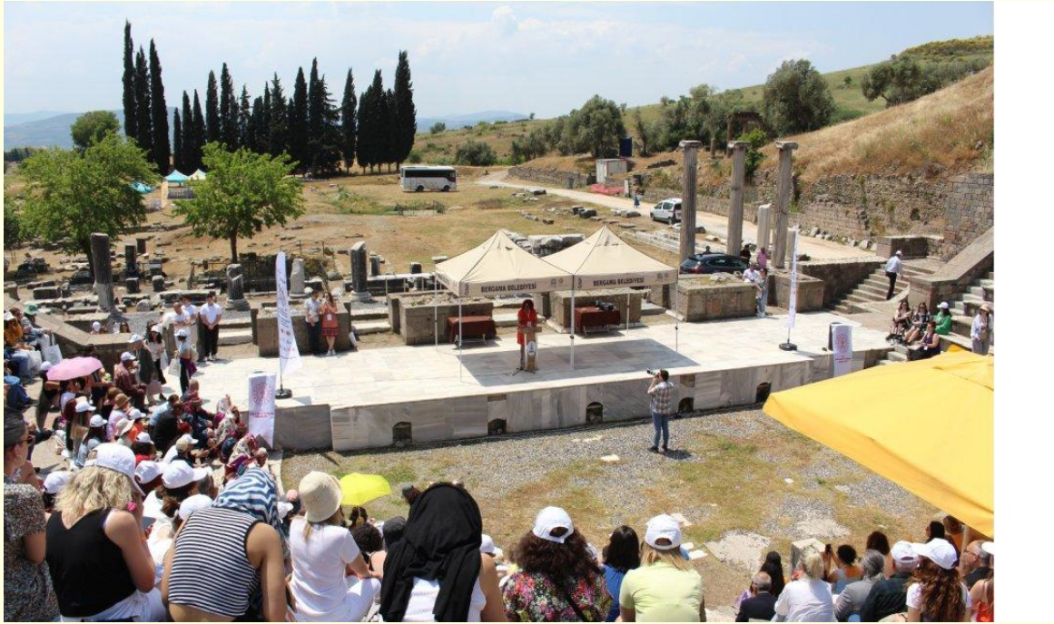
Figure 3. Images from the Group Psychotherapy Congresses (in Bergama Asclepion) ( https://bergama.bel.tr/kultur-sanat/uluslararasi-grup-psikoterapileri-kongresi/ ).