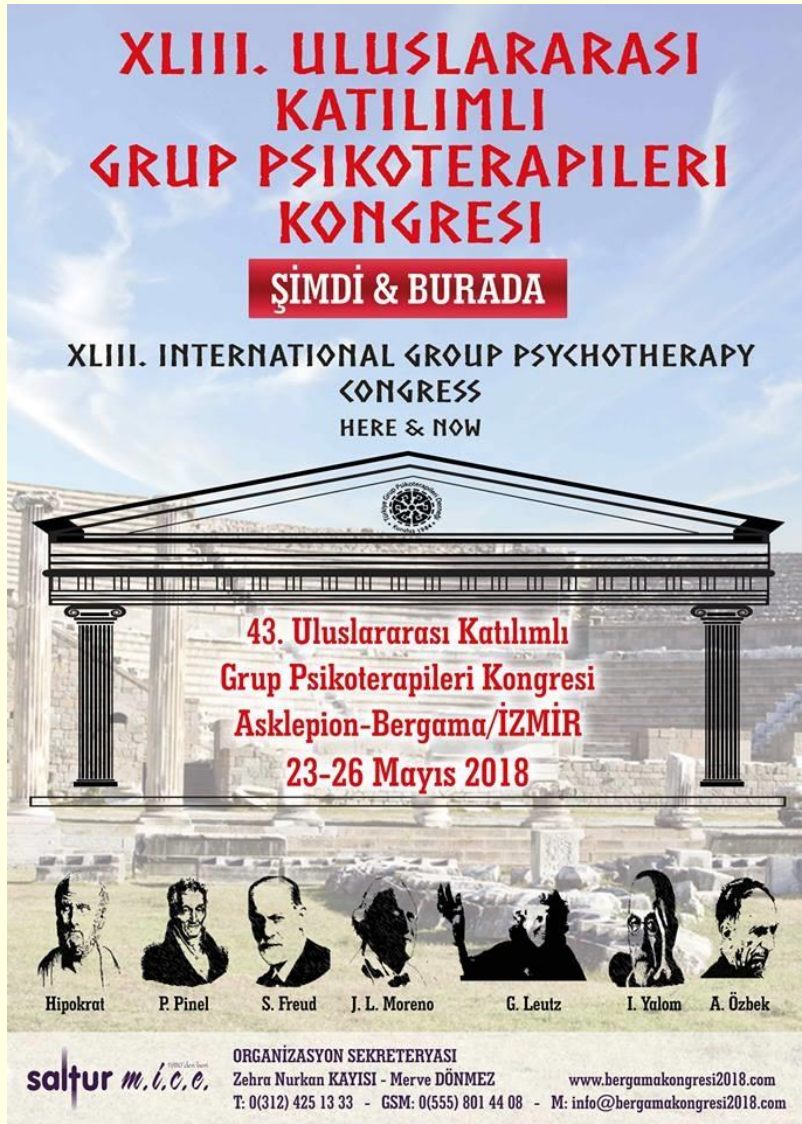
Figure 1. Group Psychotherapy Congress poster of 2018 in Bergama Asclepion.