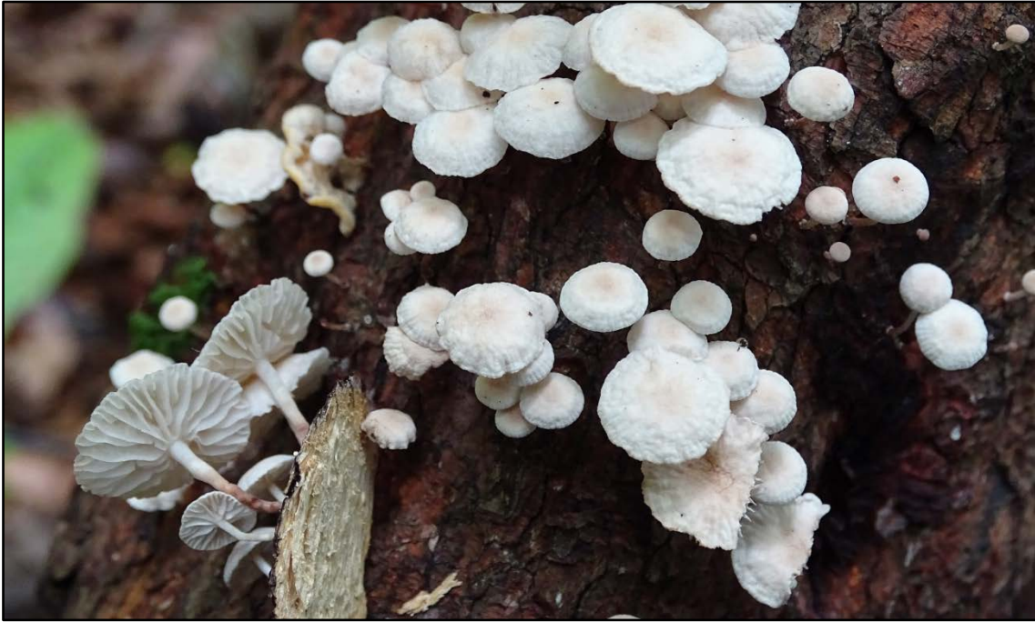
Figure 1. Basidiocarps of Marasmiellus vaillantii