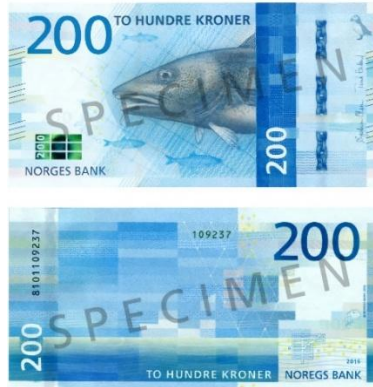
Graphic 1: Norwegian Krone (Front and back)

The aim of the present study is to identify the gastronomic elements featured on the banknotes of the world's most widely circulated and most valuable currencies. Among the examined banknotes, only those of Norway contain gastronomic elements, specifically the cod and herring fish. Norway's commitment to the fishing industry is evident through the establishment of a dedicated ministry in 1946. In Norway, cod fish is one of the most significant fish species.