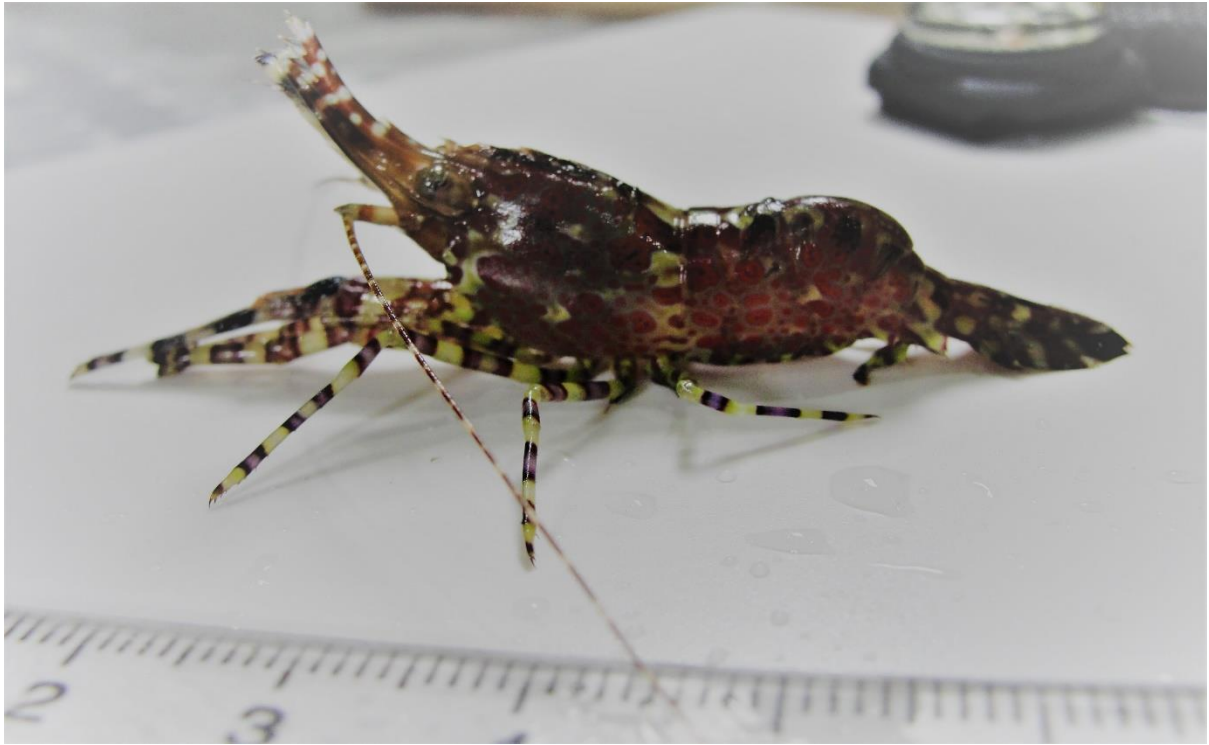
Figure 2. Saron marmoratus (Olivier, 1811) collected from Çevlik coast, eastern Mediterranean, Turkey

photographed (Fig. 2). Meristic measurements and diagnostic features were determined according to previous studies (Rothman et al., 2013; Poupin & Juncker, 2010; Baby et al. 2016).