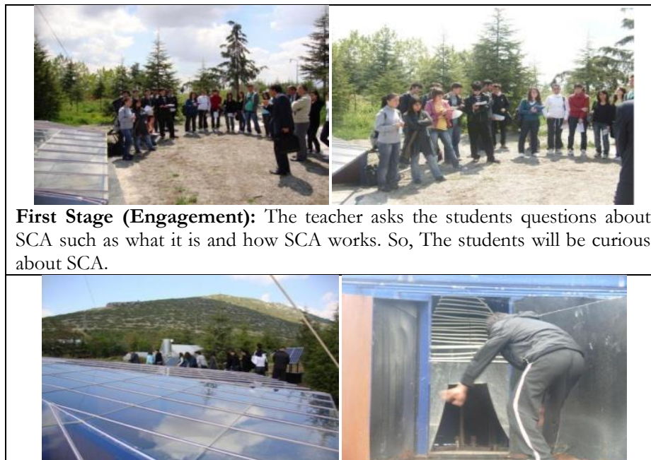
Table 2. Teaching the Solar Chimney Applications (SCA) according to 5E Learning Cycle Model (MFT) Tortop (2010)

First Stage (Engagement): The teacher asks the students questions about SCA such as what it is and how SCA works. So, The students will be curious about SCA.