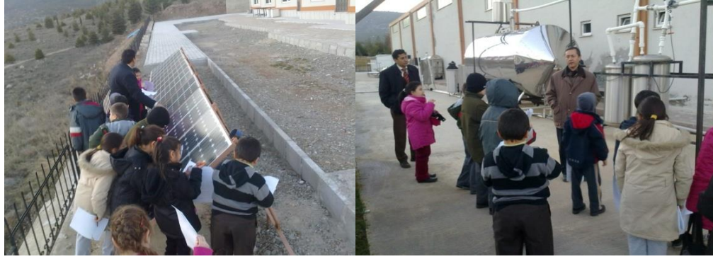
Figure 2. Examining of clean energy house and biogas plant by students at S.D.U. (Tortop, 2012a)