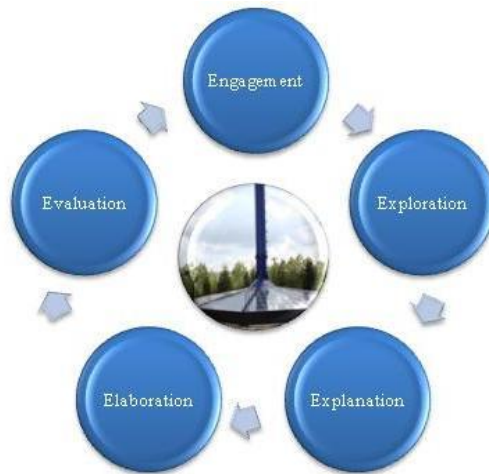
Figure 1. Teaching the Solar Chimney Applications (SCA) according to 5E Learning Cycle Model (MFT)

Meaningful field trip (MFT), evaluated in constructivism different from traditional field trips, proposed by Karplus (1964) is carried out according to the learning cycle model. Learning cycle model has undergone revision by many researchers. One of these, Bybee (1997), developed 5E learning cycle model. 5E model is composed of Engagement, Exploration, Elaboration, Evaluation and its name consists of the initial letters. According to 5E Learning Cycle model, the lesson plan (field trip) example designed by Kisiel (2006). Meaningful Field Trip has gone into literature in this way. Tortop et al., (2007) implemented the meaningful field trip (MFA) about the solar energy and the applications of it. Then in his doctoral study (Tortop, 2010), he put this application into project-based learning model