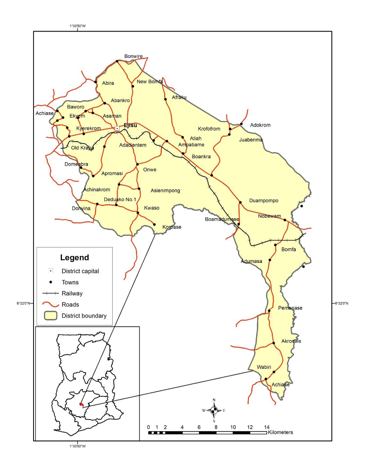
Figure 1: Map of Ejisu-Juaben District (the Study area)

truth data of field points collected in 2006 in the study area by Asubonteng & District (2007) was used for the authentication of the 2002 classification. ERDAS imagine version 2010 was used for image processing, image classification and precision assessment. ArcGIS10 was depended on for GIS operations and Excel software was used for statistical analysis. Also, Global Positioning system (GPS) instrument (Garmin 12) was used for field navigation and collection of ground truth data.