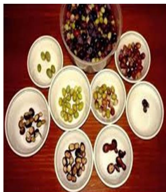
Figure 3b. Classification of olives