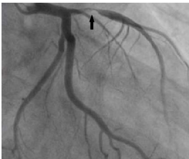
Figure 2. Coronary angiogram shows the LAD lesion (arrow). LAD = left anterior descending coronary artery.

The patient was hospitalized in a single bad room and Ertapenem 1000 mg 1x1 (IV) was ordered in order to have a prophylaxis due to immunosuppressive therapy. Immunosuppressive therapy was organized as in Table 1. The patient underwent a successful CABG in beating heart, left internal mammarian artery (LIMA) was anastomosed to LAD. Oral treatment of prednisolone was ordered as intravenous form with the highest dose in the operation day and the dose decreased day by day until the postoperative sixth day. On the postoperative seventh day oral prednisolone was started again. The patient was discharged without any complication on the postoperative tenth day. BUN and creatinine levels at discharge were 18 mg/dL and 1.12 mg/dL.