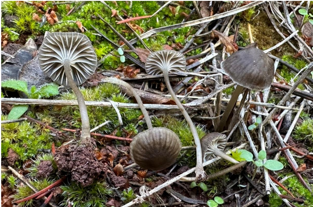
Figure 3. Basidiocarps of Mycena pseudopicta

can be differentiated from M. pseudopicta with its ascending or arcuate, subhorizontal lamellae, heterogeneous lamellar-edge and 4-spored basidia while M. subconcolor can be differentiated by its subhorizontal, subdecurrent lamellae, heterogeneous lamellar-edge and 4-spored basidia (Moreno et al., 1990; Moreno and Heykoop, 2002).