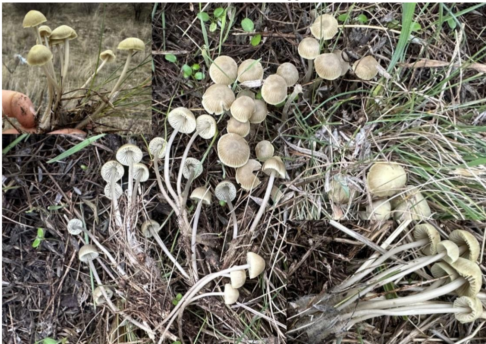
Figure 1. Basidiocarps of Mycena chlorantha

Specimen examined: Ankara, Ayaş, around Çanuh pond, at the base of Poaceae sp. on sandy soil, 40°10'N-32°26'E, 1017 m., 16.12.2023, İnci.713. Suggested Turkish name is "kumcul kukulcuk".