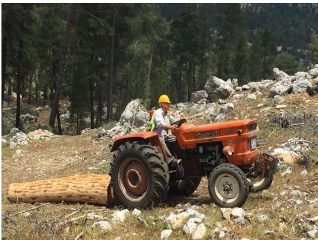
Figure 2. Farm tractor (Türk Fiat 450) skidding logs uphill from stump to landing