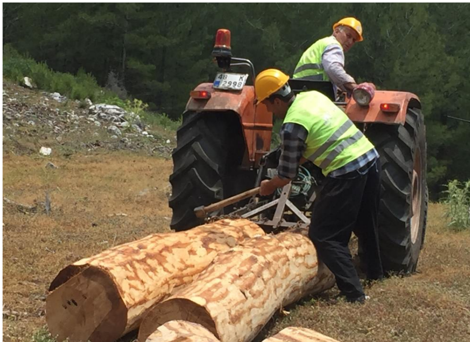
Figure 3. Unloading timber from farm tractor at landing area

Statistical analysis of One-Way ANOVA, Pearson correlation test, and linear regression were implemented based on the time data using SPSS 16 statistical program. One-Way ANOVA at 0.05 significance level was used to investigate the effects of tree volume on productivity. In order to evaluate the effect of timber volume on productivity, timber volumes skidded in each cycle were divided into three classes: low ( <0.50m^3 ), medium ( 0.50-0.80 m^3 ), and high ( >0.80 m^3 ). Pearson correlation was used to investigate the relation among timber volume ( X_1 ), number of pieces ( X_2 ), and skidding productivity ( Y ). Finally, linear regression model was developed to search for the effects of independent variable (i.e. timber volume and number of pieces) on the dependent variable (i.e. productivity).