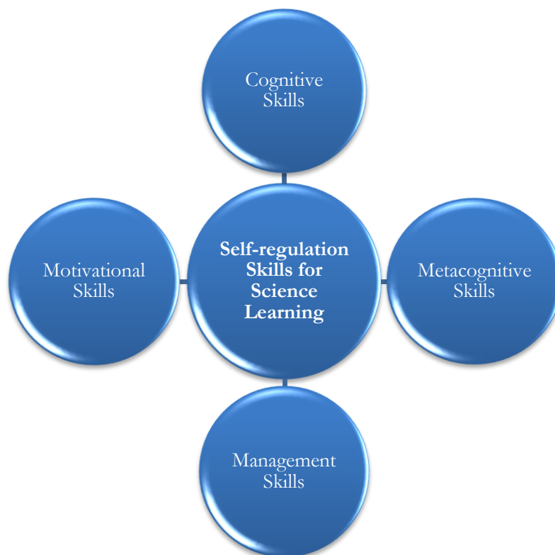
Figure 1. Dimension of Self-regulation Skills for Science Learning

It is thought that, as it is in Pitrinch (1991), the scale should be separated including “cognitive skills” and “metacognitive skills” of cognitive and metacognitive strategies in the first dimension. It has been decided that the scale should have 4-dimensional structure with its final version theoretically (see Figure 1).