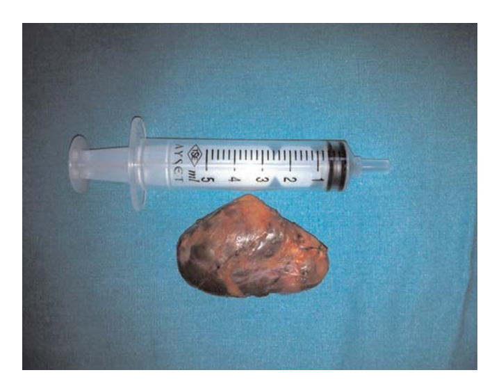
Fig. 1. Macroscopic view of the mass.

In the post-operative follow-up, a secondary neck mass formation was noticed on the contralateral (left) parotid gland five months later. USG imaging revealed a deep lobe mass with a size of 25\times10 mm. The subsequent fine needle