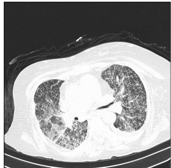
Fig. 1. Widespread sentriasiner nodules in both lungs and areas of ground glass opacities.

Thorax CT showed widespread centryacinar nodules in both lungs and areas of ground glass opacities. (Figure 1). The empirically diagnostic anti-TB therapy of isoniazid (INH) and rifampin (RFP), pyrazinamide (PZA), and ethambutol (EMB) was initiated.