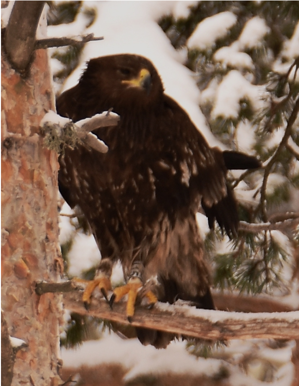
Figure 2: The Great Spotted Eagle with Ukrainian ring in Soğuksu National Park © Emre Ulusoy.

farmers to eliminate foxes and dogs who are potential threats. For this reason, the susceptibility of poisoning and the extent of scavenging must be investigated (Alivizatos & Papandropoulos, 2004). A single individual can winter on islands like Crete and mainly scavenge dead goats and sheep (Maciorowski, pers. obs.). Most of the individuals who were wintering in Israel feed with dead cranes (T. Krumenacker pers. Comm.) (Maciorowski et al., 2018). Feeding on small carcasses has been known but feeding on large carcasses is a rare record.