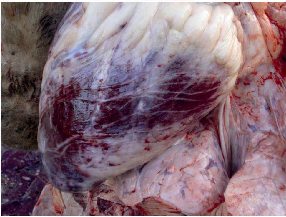
Figure 2. Petechial subserosal hemorrhages on the heart surface.

which inflammatory cells were pictured (Figure 3). Hemorrhages were found on the subserosal surface of liver and inter lobular septa of the lungs. The vacuolar degeneration was detected in hepatocytes.