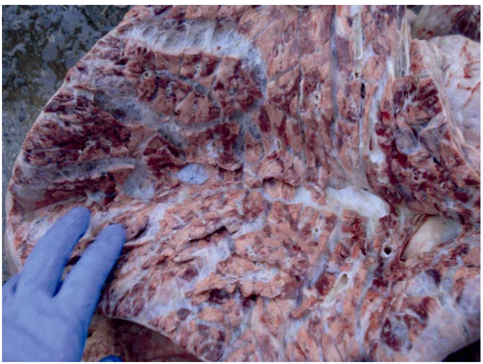
Figure 1. Pulmonary emphysema, interlobular septal connective tissue is significantly distinct.

The reasons of the high mortality rate (42.2 %) (95 of the 225 animals), due to medical management, was severe lung emphysema and its complications. The other cattle recovered completely within two weeks.