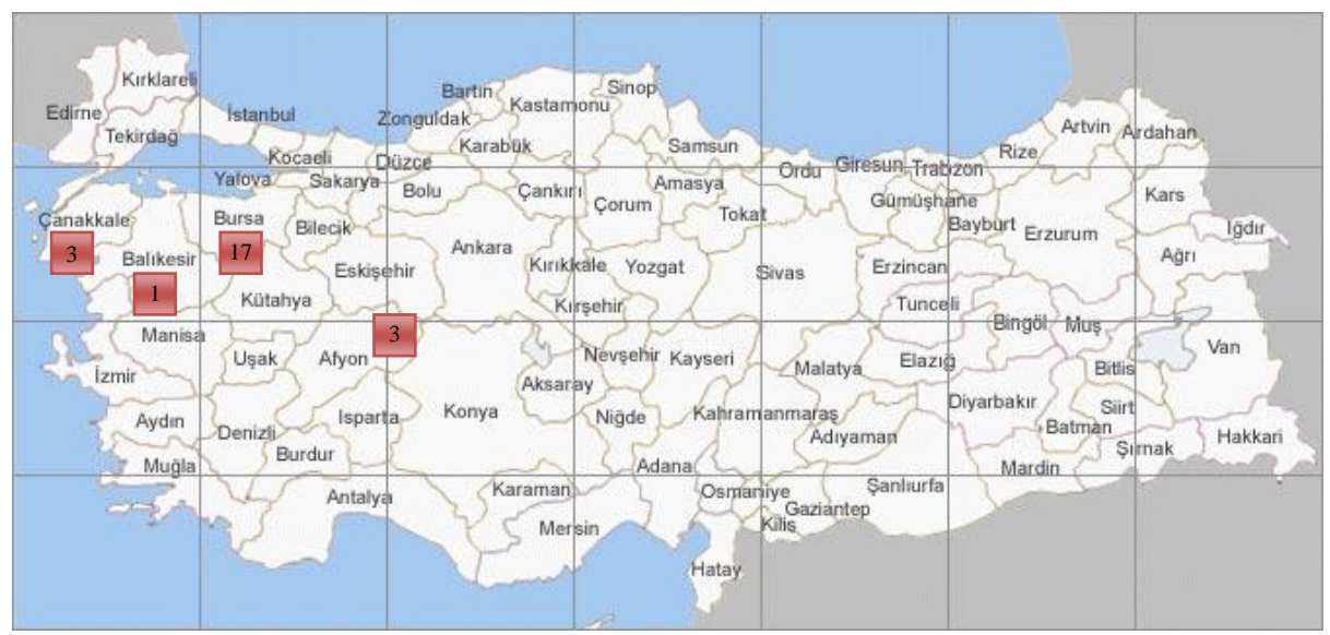
Figure 2. Map of mecA distribution of Staphylococcus aureus isolates derived from dairy cattle, NorthwesternTurkey.