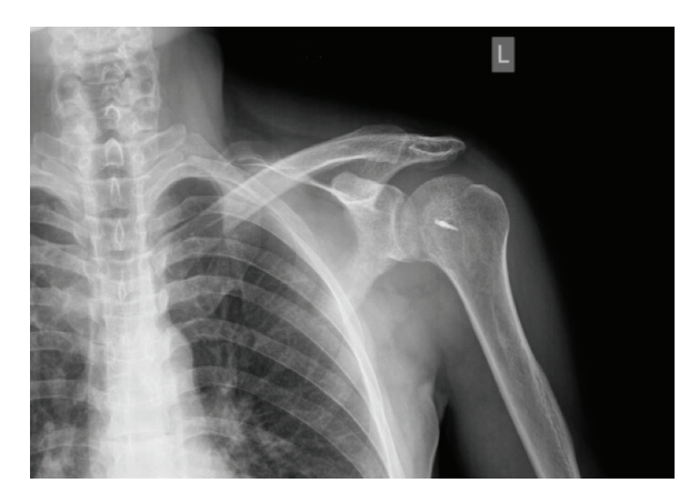
Figure 2C. Left-shoulder post-operation Anteroposterior X-Ray

Sakarya Med J 2018;8(2):447-452 SEVER et al. Mclaughlin Procedure in Posterior Dislocation Fracture of the Shoulder