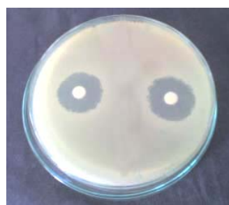
Figure 4 b: ZI for Salmonella typhi