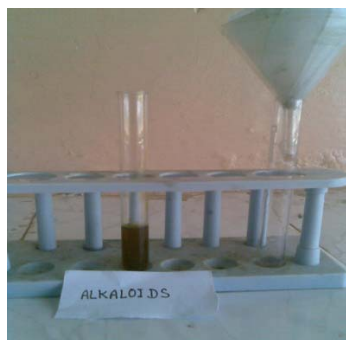
Figure 3 a: Test of Alkaloids