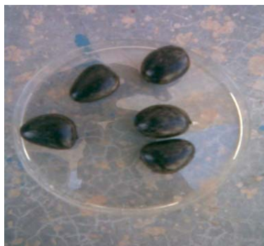
Figure 1 a: Seeds of Mucuna bracteata