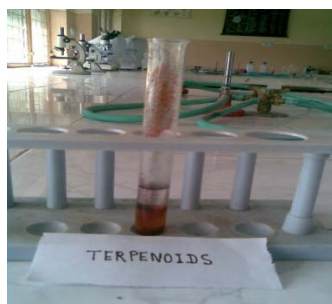
Figure 3 c: Terpenoids Test.