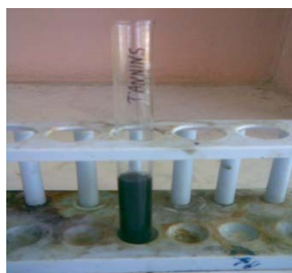
Figure 3 d: Tannins Test.