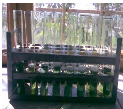
Figure 2: Various Phytocontent Test for Mucuna Seeds