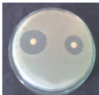
Figure 4 d: ZI for Shigella dysenteriae