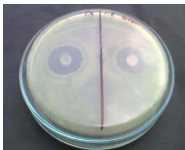
Figure 4 a: ZI for Bacillus subtilis