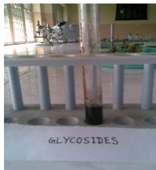
Figure 3 b: Glycosides Test