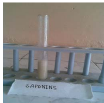
Figure 3 e: Saponins Test