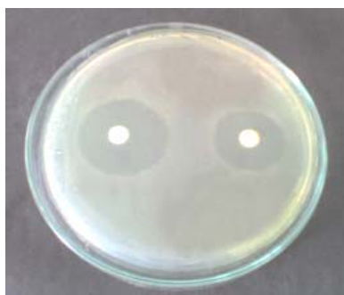
Figure 4 c: ZI for E. coli