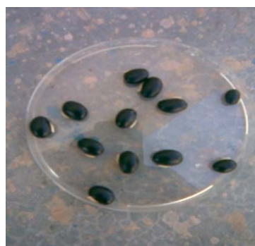
Figure 1 b: Seeds of Mucuna pruriens