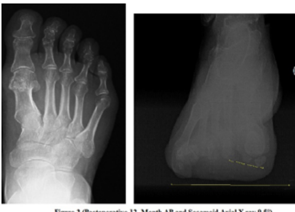
Figure 3 (Postoperative 12. Month AP and Sesamoid Axial X ray 9,5°)