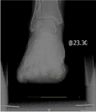
Figure 2 (53 year - old male pateient Preoperative AP and Sesamoid Axial X ray 23,3°. Patients treated with proximal dome osteotomy

Reduction of sesamoid changes by flexion of MTP joint in literatüre [5,8,22]. Kuwano T. et al showed increase in rotation of sesamoid by increase in MP joint dorsiflexion[16]. Yıldırım et al studied as same by computed tomography and showed by dorsiflexion of MP joint at angle of 0-30-70 and as increasing angle, rotation of sesamoid increases in hallux valgus [23]. In our study to standardize axial sesamoid graphy, extansion of forefoot by 10 degrees and hind foot