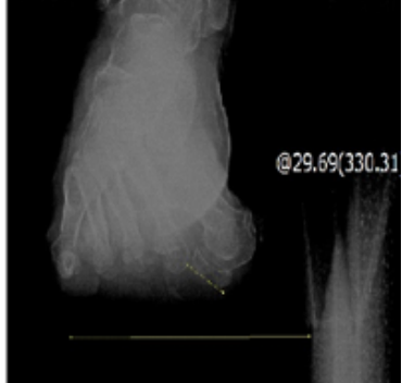
Figure 4 (57 year- old Female patient Preoperative AP and Sesamoid Axial X ray 29,6 °. Patient treated with Lapidus