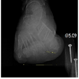
Figure 5 (Postoperative 13, Month AP and Sesamoid axial X