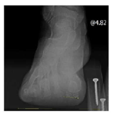
(Figure 7 Postoperative 12. Month AP and Sesamoid Axial X ray; 4,8°)