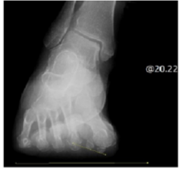
Figure 6 (55 year -Old Famele patient preoperative Ap and Sesamoid Axial X ray 20°, Patient treated with distal chevron osteotomy )