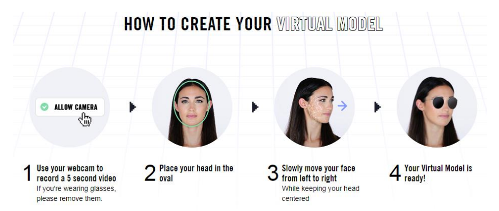
Figure 2. Directions to create your virtual model on 3-D try-on Website

The second session which was the 2-D display experience was an ordinary one. It was not possible to put any sunglasses on. One could only view the sunglasses on the screen, and rotate it to see from different angles only.