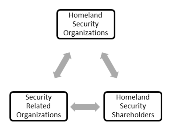
Figure 2. Multi-Dimensional Coordination of Homeland Security Sphere

National terrorism preparedness requires these numerous entities' preparation to operate in close coordination to meet various threats and to mitigate their consequences (Wise and Nader, 2002). As then USA president George W. Bush stated that the efforts to defend the country have to be comprehensive and united (Bush, 2002). Therefore, the coordination of both public and private efforts in every level of federal, state and local have to be managed deliberately.