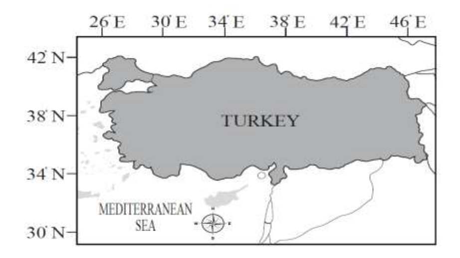
Figure 1. Sampling area (O), Northeastern Mediterranean sea

Trigloporus lastoviza individuals were captured by commercial bottom trawler at a depth of 155 to 212m off the Iskenderun Bay (36°13′650 N-035°23′032 E, 36°16′622 N-035°18′509 E) in 2015 fishing season (Figure 1). A total of 84 specimens (52 females and 32 males) were collected and transported to the laboratory on ice. Each fish was measured for total length to the nearest 0.1cm, weight (W) was weighted to the nearest 0.1g and the sex was determined by macroscopic observation of the gonads at the laboratory in F1rat University. In the length-weight equation "a" and "b" are intercept and the slope (=exponent) of the length-weight curve, respectively. Data were subjected to statistics analysis by using the IBM SPSS Statistics ver. 22.0 for Windows. Total lengths and weights were fitted to the length-weight equation: W=aL<sup>b</sup>, by using least square methods with Statistical software [14]. The "b" value for this species was tested by a t-test at the 0.01 significance level to verify if it was significantly different from 3 [15].