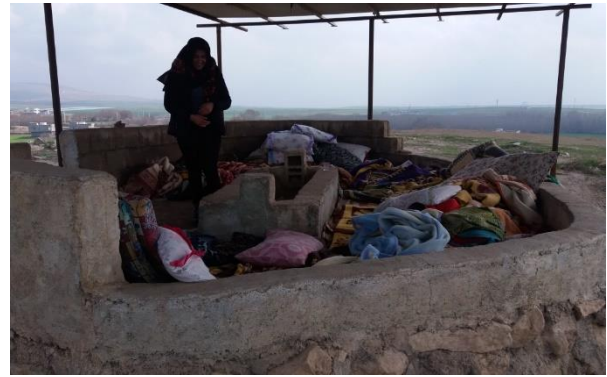
Figure 2. Mound Girnavaz and the sacred bed where physically disabled and psychiatric patients are believed to sleep with the genies at night.

It is believed that demonically possessed patients or people with psychological disorders can get well after spending a night with these genies. As the Nusaybin genies came to listen to Muhammad the Prophet on Wednesday, the patients and their family distribute an especial type of oily bread, come to the top of the ‘Mound of Genie’ in Nusaybin on Wednesday, and mainly those with psychic illness spend the whole night on the top of the hill. There have been many demonic legends related to Girnavaz; however, wide practices of the treatment of demonic possession were mainly started during 1970s.