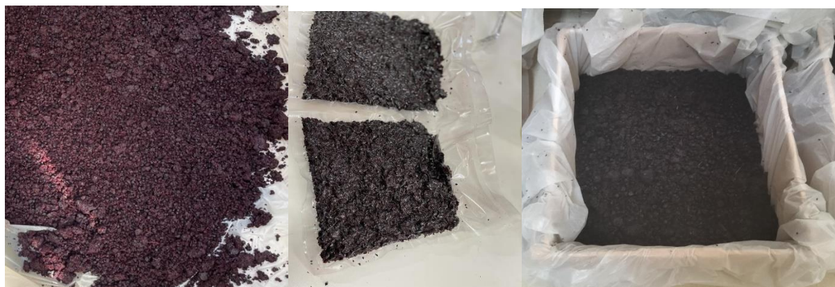
Figure 1. Aronia pulp, ensiling, and aerobic stability

Each treatment included five replicate silage bags, which were stored for 30 days in a dark environment at 20 \pm 2 °C, protected from direct sunlight. After the fermentation period, the silage bags were opened and subjected to a 7-day aerobic stability test under controlled laboratory conditions ( 22 \pm 1 °C and 65% relative humidity). In addition, temperature changes in silage samples and ambient temperature were monitored for 7 days (hobo pentant data logger) during the aerobic stability period (Chen et al., 1994). Aerobic stability analyses were performed on days 1, 3, and 7 after bags opening (Figure 1).