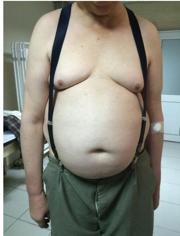
Picture 3. Appearance of the patient with Klinefelter's Syndrome

The autoimmune markers were within normal limits: A-TPO: 51.5 IU/ml (0-57), Anti TG: <15 IU/ml (0-114), RF: 12.7 IU/ml (0-15), CRP: 3.02 mg/l (0-5), Sedimentation: 20 mm/60 min (<20).