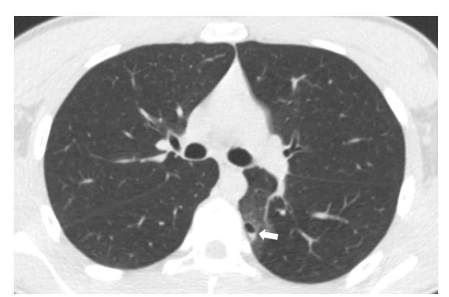
Figure 1. A 17-year-old male with blunt thoracic trauma after a traffic accident. Axial CT image showing traumatic pulmonary pseudocyst with air-fluid level (white arrow).

The patients with TPC detected on CT comprised 5 males and 1 female with a mean age of 25.5 \pm 10.1 years (range, 15-43 years). The CT findings of the patients are summarized in Table 1. Blunt thorax trauma was caused by traffic accidents in 4 patients