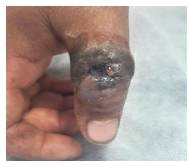
Figure 1. A 1.5x1.5 cm irregular and black skin eschar on the right thumb with central necrotic appearance

lar region were used in the PCR reaction (4). The PCR reaction was run on a Qiagen RotorGene 6000 (Hilden Germany) Real-time instrument using Evagreen qPCR master mix (Bio-Rad Lab Inc USA). Cutaneous anthrax was diagnosed and the patient was hospitalized.