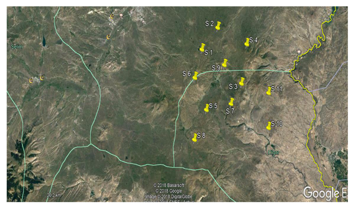
Figure 1 Map of Digor showing the region under investigation.

Surface soil samples were collected from flat areas with a homogeneous distribution defining the region and without agricultural activities close to the settlement areas. The location of each area in which the samples were collected was measured by the GPS (Global Positioning System) device. Samples of approximately 2 kg were taken from 4-6 different sampling points and at different depths ranging from 0-15 cm in each station to provide better sampling in the studied area. The surface soil samples were properly encoded with respect to the location of the sampling site. After removing foreign substances such as plant roots and pieces of stones, the soil samples were powdered and dried in an oven at 105 °C for 15-20 hours to rout out moisture. The samples sieved with a 2 mm mesh sieve, packed in a plastic containers, weighed and firmly sealed for 30 days to reach secular equilibrium between <sup>226</sup>Ra (daughter of <sup>238</sup>U) and <sup>232</sup>Th with their daughter nuclei. Natural radioactivity concentrations of each sample collected were determined by counting approximately 80000 s using NaI(Tl) scintillation detector based on a gamma-ray spectrometer system. The detector is shielded using 5 cm thick lead layers on all sides to reduce minimize the contribution of building materials and the surrounding radiation.