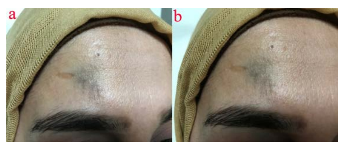
Figure 1. Baseline photos of patient with the nevus of Ota.

with 2 sessions of 1064-nm Q-switched Nd: YAG. The entire lesion was then scanned with a 3 mm spotsize at 720mj/cm2 and 8 Hz. The treatment produced an expected petechial rash (Figures 2a and 2b). Spot hunting" was then performed on the second scan to