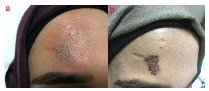
Figure 2. After laser treatment (a) and after 1 week treatment (b).

with 2 sessions of 1064-nm Q-switched Nd: YAG. The entire lesion was then scanned with a 3 mm spotsize at 720mj/cm2 and 8 Hz. The treatment produced an expected petechial rash (Figures 2a and 2b). Spot hunting" was then performed on the second scan to