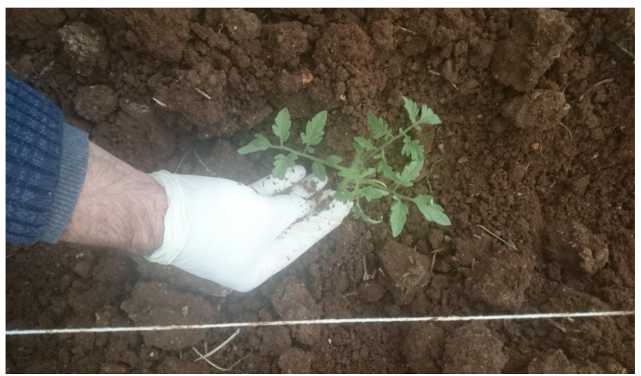
Figure 3. Greenhouse Yaren upper throat F1 fertilizing the roots of tomato seedlings

Tomatoes, peppers and eggplants in the summer vegetables group are one year in warm climates and several years in tropical climates. Tomato seedling was planted in places previously prepared with hand-hoe and then juice was given (Figure 3).