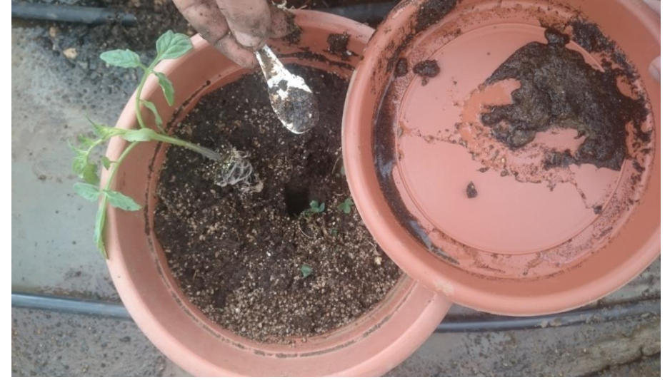
Figure 4. Dodder seed planting with soil and Yaren F1 tomato seedlings

In the greenhouse pot experiment cabin seedling planting and tuber planting are given in Figure 4.