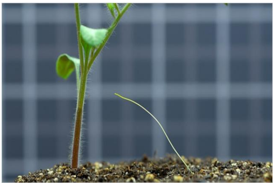
Figure 6.After the exit of dodder host to the orientation of tomato roots

The dodder stems are threadlike and have no leaves. Therefore it does not contain chlorophyll. Hostorium is attached to the body and branches of host plants. They are full-parasitic clitoral plants without chlorophyll fed from their bodies by sending houstoriums to the host transmission bunches (Figure 6).