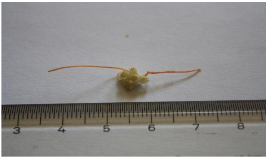
Figure 9. General view of the dodder flowers

The flowers are small and are collected in the case of kimos flowers. The flower crown is white in color. In flowers, sepals are often combined; usually in five parts and rarely in four or three parts (Figure 9). The stamens are attached to the corolla tube, and most of the species are found in the staminal bracing under the stamens. The ovarium is two carpels, and each carpel has two seeds. The stylus may be combined or discrete, stigmatic, round, disc-shaped, or extended.