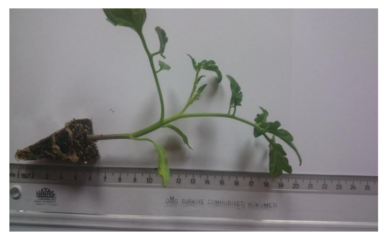
Figure 1. Yaren F1 tomato seedling in general

The materials of this research; Yaren F1 Tomato andDodder ( C. campestris Yunck.); under normal conditions, dodder seed kept at low temparature (at 3.5^{\circ} C, -20^{\circ} C, Sulfuric acid (H<sub>2</sub>SO<sub>4</sub>), purified water and kept at room conditions (Figure 1, 2).