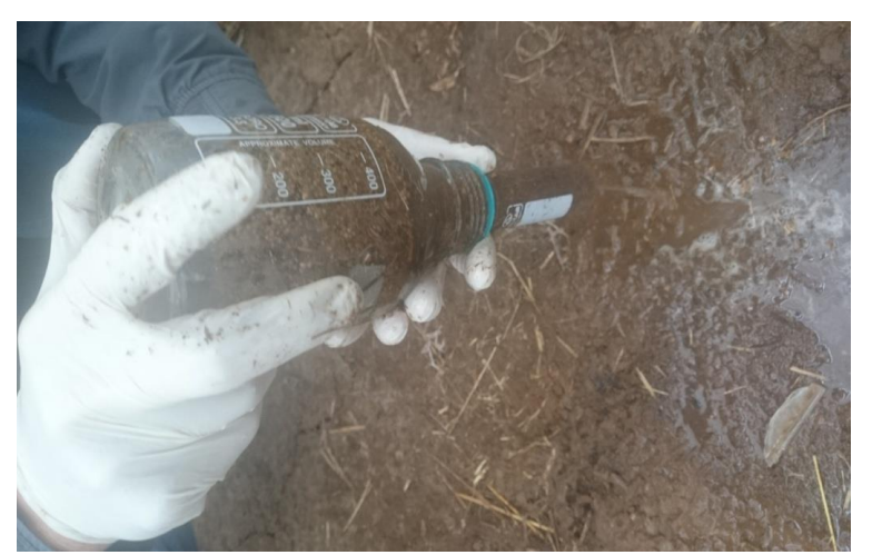
Figure 2. Sulfuric acid application to the dodder seed