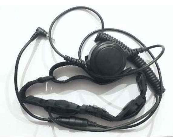
Figure 4. Throat microphone with two sensors

Throat microphone transmits voice with throat vibration. Therefore, the voice can be transferred clearly even in noisy environments. In order to convey voice commands into EasyVR voice recognition module, throat microphone with two sensors (shown in Figure 4) are used (Throat microphone two sensors datasheet, 2016).