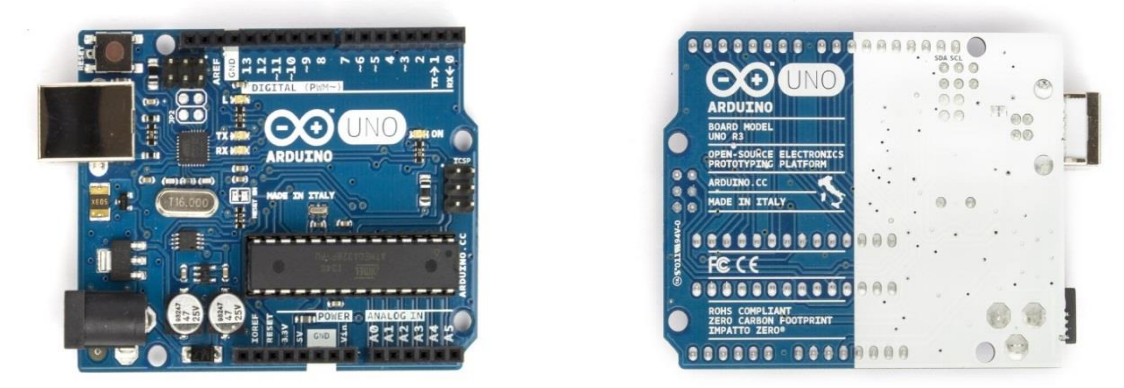
Figure 2. Arduino Uno microprocessor card

Arduino, a ready-to-use electronic card, has a main microcontroller, pins to connect control units, and communication ports (Delebe, 2014). The Arduino Uno is a microcontroller board based on the ATmega328. There are 14 digital input/output pins, and 6 of them can be used as PWM output. Also, it has 6 analog input pins, 16 MHz crystal oscillator, a USB input, a power input, and reset button. The card consists of the necessary things to support microprocessor (Arduino Uno Datasheet, 2015). Figure 2 describes the front and back surface of Arduino Uno: