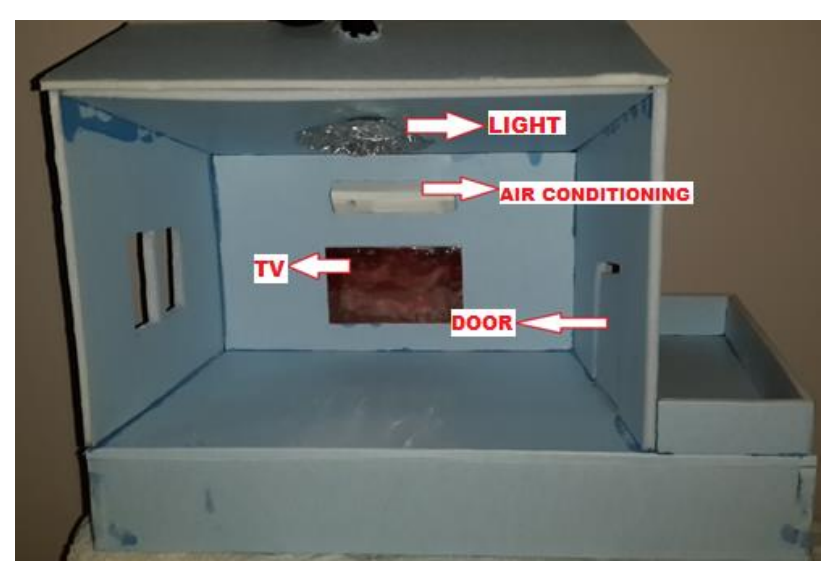
Figure 5. Design of the voice controlled home automation