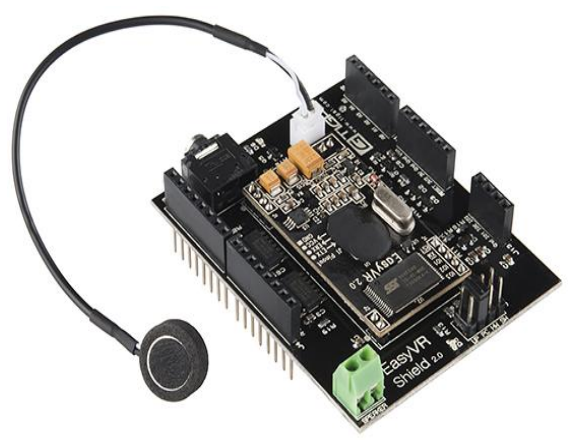
Figure 3. EasyVR Shield 2.0

EasyVR Shield 2.0 is a voice recognition shield developed for Arduino. It was designed to provide versatile, robust and cost effective solutions for various voice recognition applications. It is commonly used for voice controlled light switches, locks, curtains or kitchen appliances in home automation solutions (EasyVR User Manual, 2015). Figure 3 shows an EasyVR Shield 2.0 module.