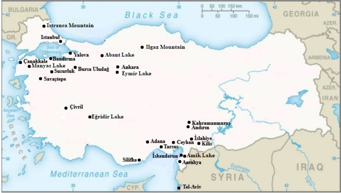
Figure 1: The locality data of the Bird Collection of Istanbul University Biology Department ( https://www.drivingdirectionsandmaps.com/wp-content/uploads/country-maps/tu-country-map.gif , is used to transform from this website).