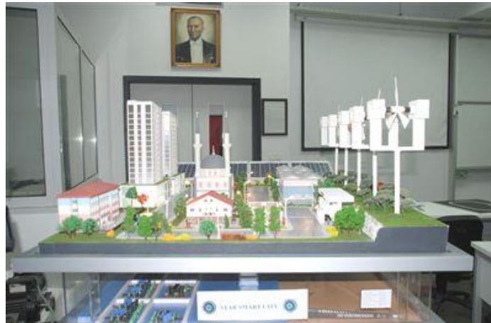
Figure 1. Miniature smart city

can visualize and understand the concepts better, as also demonstrated by Chowdhury et al. (2013). The smart city model presented here simulates real life loads such as residential houses, schools, industrial premises, social and cultural sites, and public parks. It employs solar energy panels and wind turbines as the energy sources to feed these loads. Wireless communication technologies and power electronics hardware were installed for smart energy management to monitor and control of renewable energy sources and loads. This demo simulation platform as seen in Figure 1 has been being used at a university in Istanbul for the engineering education, which helps students to learn many concepts in a Smart City.