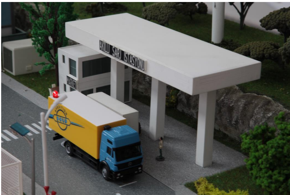
Figure 4. Wireless energy transfer from charging station to truck

To demonstrate the wireless energy transfer technology a model truck, that follows a preset path on the road of the miniature smart city, is used. In each lap, truck stops in front of the charging station for a while. During that time wireless energy transmitter circuit in the charging station is activated, which, in turn, enables the wireless energy transmission via the coils that are both in the station and the truck. Energy is received by the truck and regulated by the wireless energy receiver circuit and used to light an LED on top as shown in Figure 4. Due to circuits and energies being small actual charging is not possible, however this application is quite satisfactory for teaching the fundamentals of wireless energy transfer.