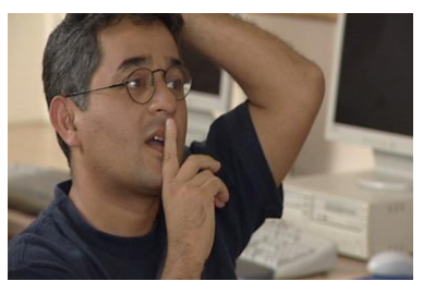
Figure 13 Figure 14 Figure 15