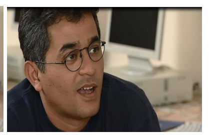
Figure 16 Figure 17 Figure 18

When publicly nominated to answer the question (lines 1 to 12), L3 mumbles (line 11) to come up with a word banging his head with left hand (Figure 13). This suggests that he is trying to think of the right answer (line 13) while keeping his left hand on his head to think of the correct answer. Keeping his left hand on his head indicates that he is requesting his continuous turn. This subsequently prevents the teacher interrupting L3, allowing him to extend his turn for 3 more seconds (line 14). This provides L3 with an opportunity to contribute to the interaction, during which interestingly, other students help L3's reply to a teacher's question in line 15 by collectively suggesting a possible answer. It demonstrates that other learners take his bodily movements as a public sign for help. Then, L3 repeats after their answer in line 17 (Figure 14). In other words, embodied cues serve as a mediator to cause other students to collaboratively interact, which in turn, results in another space where a teacher can correct their answer in lines 18 to 20. In the process of this pedagogic activity, multimodality is shown to facilitate an interactional space where perceived teacher offers student-in-interaction opportunities to contribute, and other students