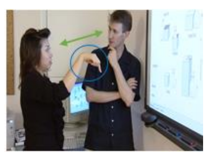
Figure 1 Figure 2 Figure 3